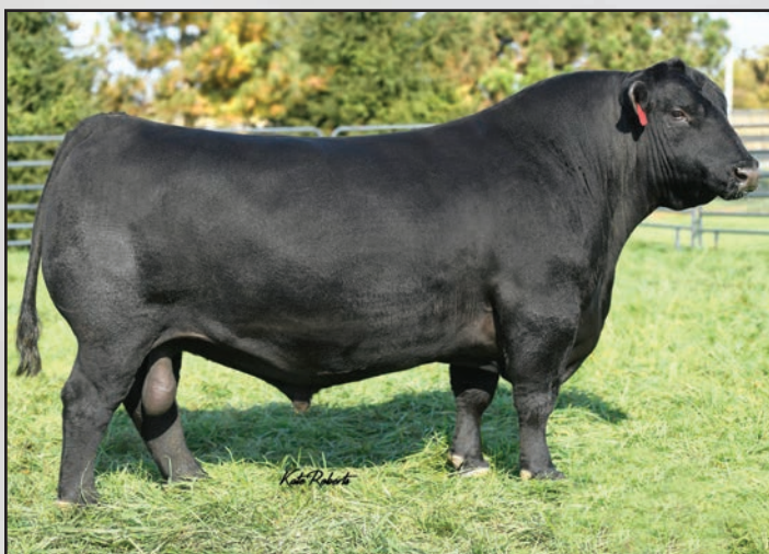
Ellingson Homestead 6030, a maternal brother to the dam of Lot 271.

Ellingson Rider Pride 2940 is a balanced-trait Rider Pride son that ranks amongst the best of the Angus breed for weaning and yearling weight, scrotal circumference, claw shape, heifer pregnancy, carcass weight and tenderness. His dam by Ellingson Authorize 7057 is a maternal sister to the $130,000 top-selling bull of our 2017 production sale, Ellingson Homestead 6030.