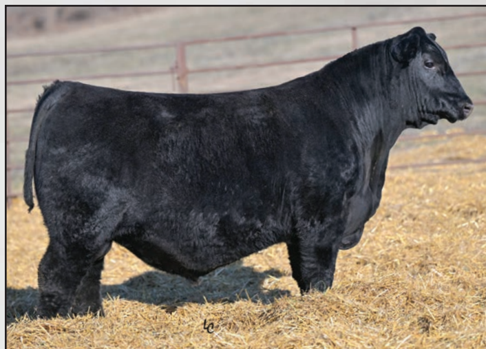
Lot 270, Ellingson Rider Pride 2882.