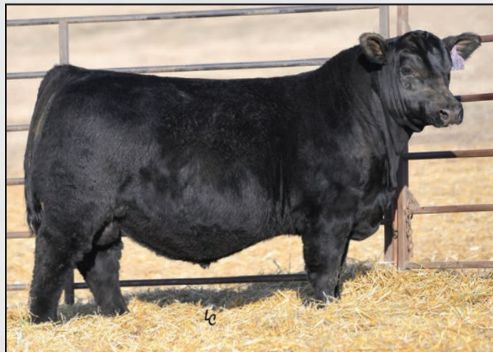
Ellingson Three Rivers 0082, a full brother to Lots 180-184.