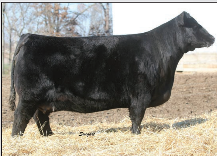
EA Emblynette 8113, the dam of Lots 246 and 247.