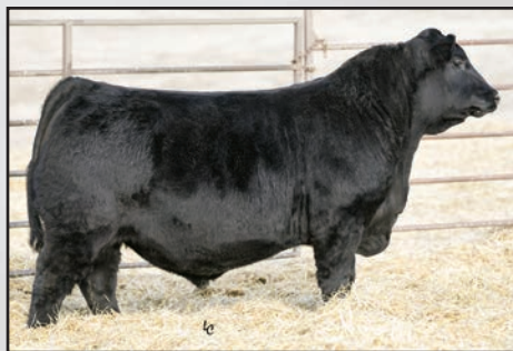
Ellingson Three Rivers 0299, a full brother to Lots 203-207 and a maternal brother to Lot 208's dam.