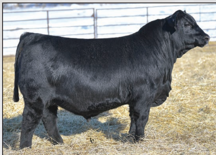
Ellingson Profound 2125, a maternal brother to Lot 196.