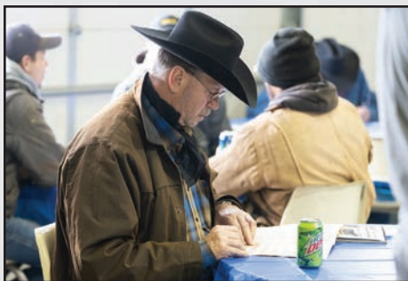
Bob Tuhy selected a maternal brother to Lot 209 last year.