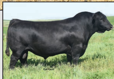
Above: Lot 43, Ellingson Badlands 3148.