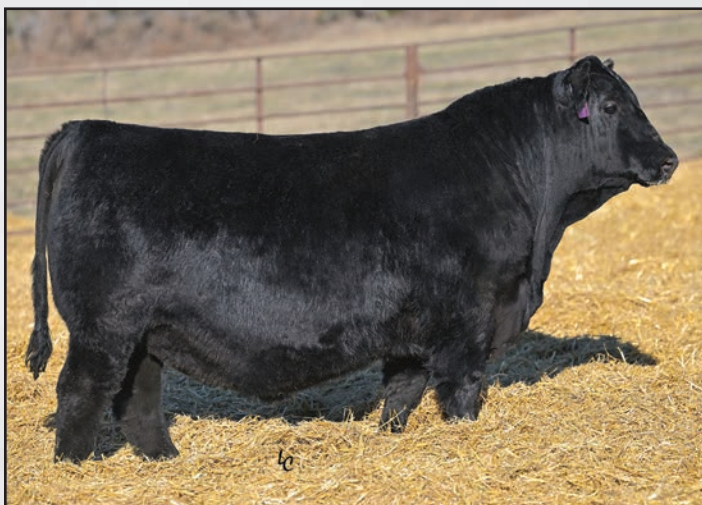
Lot 9, Ellingson Prolific 3044.

This is a powerful trio of flush brothers backed by proven maternal excellence and a growth curve tailored for the cow-calf industry. Lot 9 has been a standout from early on and is a must-see. Their Roughrider dam is following in the footsteps of her mother, two of the most elegantly designed and phenotypically correct females on the ranch and setting a high standard for fertility and production. Their Pathfinder donor granddam has a production birth ratio of 6/91, a nursing ratio of 6/105, a yearling ratio of 5/107 and a ribeye ratio of 5/103. A maternal brother to their dam was the $22,000 selection of B&D Angus and Herefords in 2022, while another was the $32,500 selection of Buford Ranches in 2021. Other maternal brothers to the dam are working for Jeb Fredericks, Steve Gadd and Double Bar 7 Ranch. Three of their maternal sisters are in our cowherd. Lots 9-11 are flush brothers.