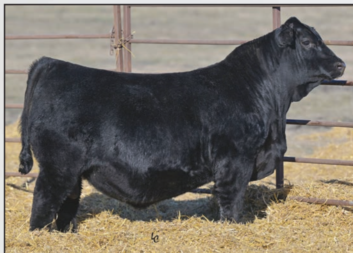
Lot 1, Ellingson Prolific 3050.

We could not be more thrilled than to start off the 2024 Ellingson Angus Sale with a pair of brothers that encapsulate the fundamental components of what our breeding program strives to produce. Their phenotypic and genotypic dominance represent the thrilling possibilities of what their young sire has the capability to bring to the beef industry. These two individuals offer immeasurable potential. Their Pathfinder donor dam posts a stellar production record, with a production birth ratio of 6/100, a nursing ratio of 6/109, a yearling ratio of 2/114, a ribeye ratio of 2/103 and a 367-day calving interval, all while being flushed. Her outcross, yet time-tested, pedigree combines two maternal greats in Thunder and Territory. They are maternal brothers to the $90,000 second-top-selling bull in our 2023 sale, Ellingson Navigator, that sold to Katus X7 Ranch and Beran Brothers. No matter how far the journey, these brothers alone are worth the trip to St. Anthony on Feb. 3. Lots 1 and 2 are flush brothers.