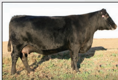
EA Emblynnette 434, the great-granddam of Lot 287.