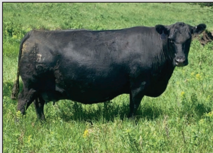
EA Blackclass 4024, the dam of Lot 144 and a maternal sister to the dam of Lot 145.

This easy-fleshing, modest-sized Turn Key son comes from a long line of females that have demonstrated superb longevity. He is a maternal brother to EA Blackclass 7496, a donor roster holder and dam of the $19,000 Ellingson Practical 9122 at Weers Angus. Maternal brothers have been purchased in past sales by Little Timber Farms and Mike Rogstad. His dam is a maternal to Lot 145's dam.