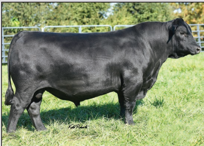
Ellingson Rangeland, the maternal grandsire of Lots 68-73.