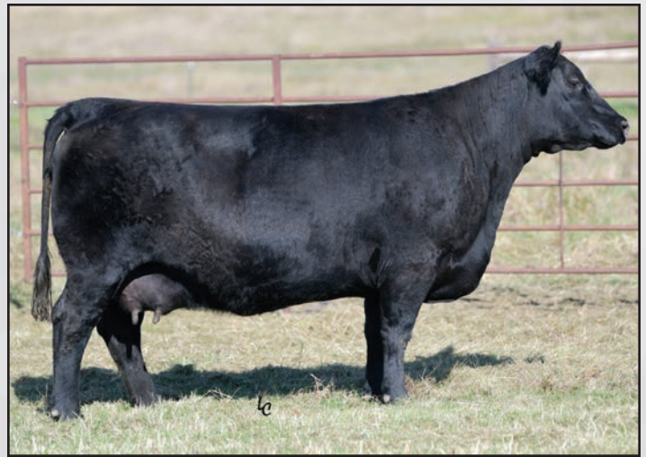
EA Miss Blackbird 5054, the maternal granddam of Lot 288.

We emphasize collecting maternal data so we are able to make better breeding decisions here and provide you with a more thorough prediction of what a bull's daughters will be like. The cows that anchor Lot 288's pedigree have risen above their peers for some of the traits most crucial in making long-lasting matrons. His dam is a direct daughter of the heralded EA Miss Blackbird 5054 donor. She is best known as the dam of the $65,000 Ellingson Turn Key 0170 and the $20,000 Ellingson Bold, two sires we have aggressively utilized in both our A.I. and embryo programs.