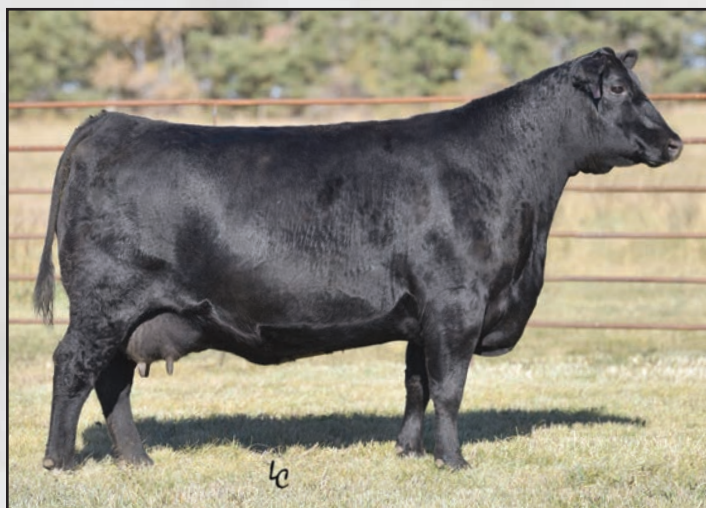
EA Primrose 3149, the dam of Lot 85 and the granddam of Lot 86.

We have continued to mate our Homegrown daughters to Badlands to double-down on superior foot quality and fertility. You can utilize this negative-birthweight EPD and double-digit CED bull with confidence on virgin heifers. A full sister is in our bred heifer pen.