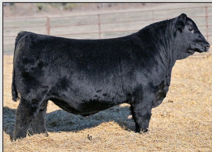
Lot 108, Ellingson Barricade 3009.

Leading off a sire group that has been extremely popular amongst our commercial clientele over the past few years, this bull is an absolute meat wagon. He came off his dam at an actual weight of 1,075 pounds and hasn't looked back since. His unique blending of power and strongly anchored maternal values make him a strong candidate to drive a program into the future. His Pathfinder donor dam by Koupal Juneau 797 has recorded a production birth ratio of 5/96, a nursing ratio of 5/107, a yearling ratio of 3/103 and a ribeye ratio of 1/111 and settled to first-service A.I. every year of her production career thus far. She has impeccable foot design and soundness paired with elegant femininity and maternal softness. She earned her spot on the donor roster the old-fashioned way – through superior production and fertility. His maternal brother was Lot 2 and the $22,000 feature of our 2022 production sale. Sixteen full and maternal sisters have been retained in our own cowherd.