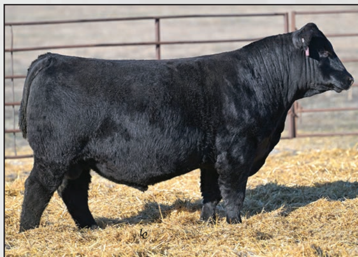
Lot 113, Ellingson Barricade 2823.