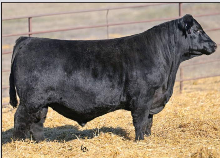
Lot 127, Ellingson Barricade 2875.