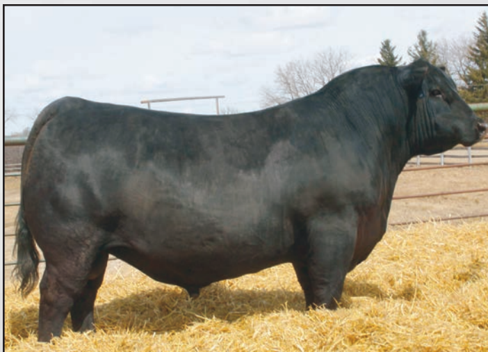
Ellingson Profound 8155, the maternal grandsire of Lots 97-101.