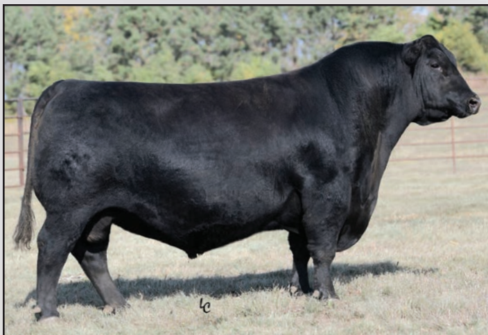
Ellingson Rider Pride 7282, a full brother to the dam of Lots 222 and 223.