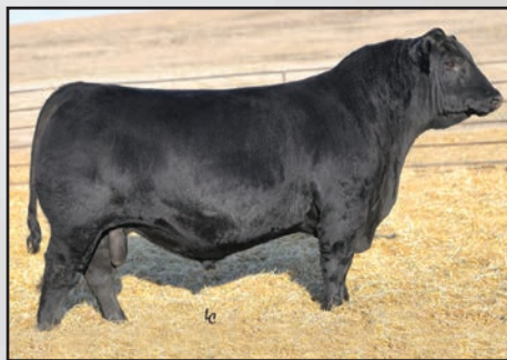
Ellingson Three Rivers 8062's influence sells.