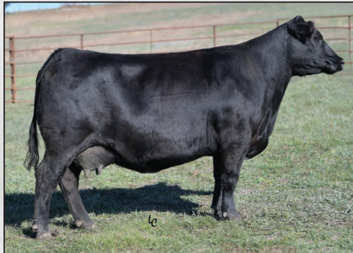
EA Blackclass 3142, the dam of Lots 35 and 36 and the granddam of Lots 27-33.