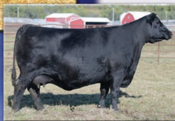
Left: EA Queen Dolly 3246, the donor dam of Empire.

Ellingson Authorize 7057 EA Queen Dolly 3246 Koupal Advance 28 EA Emblynnette 5169 Ellingson Bandwagon 1053 EA Queen Dolly 1051