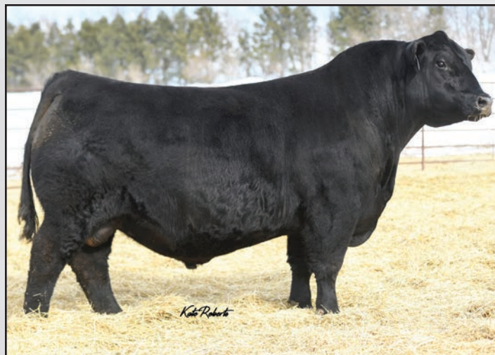
Ellingson Badlands 0285, a maternal brother to Lot 104.