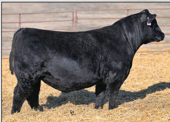
Lot 63, Ellingson Badlands 2804.

You will appreciate the masculinity, crest and natural muscle shape in this long-age Badlands son. He validated his genetic merit for performance capability by earning a distinguished weaning ratio of 108 and a yearling ratio of 115. His Authorize dam is a member of an impressive flush of both bulls and females. His Pathfinder granddam has recorded a production nursing ratio of 5/107, a yearling ratio of 3/110, an IMF ratio of 3/100 and a ribeye ratio of 3/107.