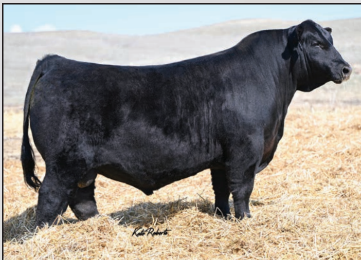
Ellingson Statement, a maternal brother to Lot 185.