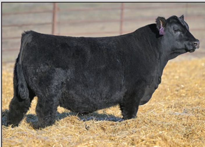
Lot 53, Ellingson Badlands 3256.