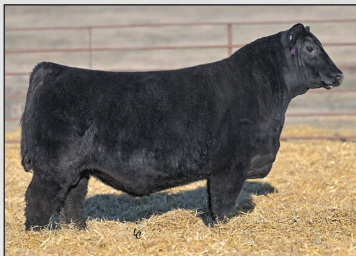
Lot 48, Ellingson Badlands 3130.

Astute producers will have no trouble finding this standout when sorting through the pens. Built in the correct manner – from the ground up – he possesses the athleticism we strive to stamp into every bull that leaves the ranch. You will marvel at the amount of muscle shape and red meat he carries throughout in a proudly presented package. He came off his dam at 850 pounds and earned a weaning ratio of 107. His dam is a maternal sister to the proven commercial-heifer-project leader, Ellingson Icon 5062, a $20,000 feature in 2016 to Alta Genetics and Diamond J Angus. She continues to be an active breeder at nine years of age. His Pathfinder grandmother has recorded a production birth ratio of 8/97, a nursing ratio of 8/102, a ribeye ratio of 5/103 and a 367-day calving interval, having settled to first-service A.I. every year.