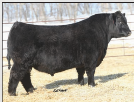
Ellingson Uncharted, a maternal brother to Lot 277.