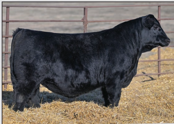
Lot 98, Ellingson Rangeland 3110.