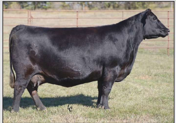
EA Queen Dolly 2133, the maternal great-granddam of Lot 67.