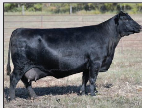
EA Queen Dolly 7059, the dam of Lot 278.