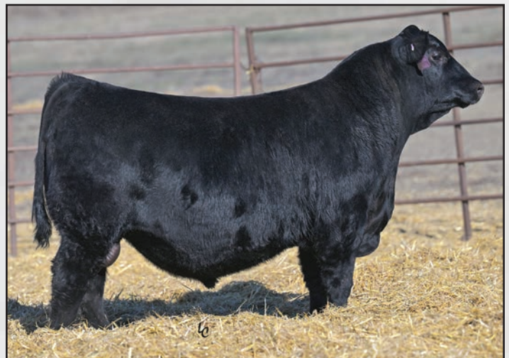
Lot 16, Ellingson Prolific 3404.