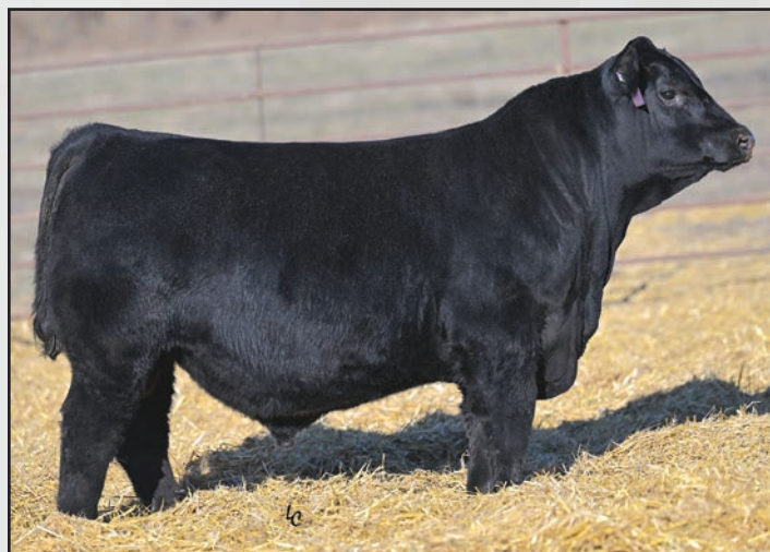
Lot 19, Ellingson Prolific 3961.

This is the only chance to purchase the one and only Prolific progeny out of the well-known EA Queen Dolly 3246 donor. He possesses an explosive data set in combination with a powerful and robust physical package that those familiar with the 3246 sons have become accustomed to. His maternal brothers include the $110,000 Ellingson Rider Pride 7282, the $32,500 Ellingson Three Forks 0252, the $25,000 Ellingson Empire 0350, the $20,000 Ellingson Authorize 0380, the $27,500 Ellingson Blockade and the $24,000 Ellingson Fortified. His donor dam has recorded a production birth ratio of 7/100, a nursing ratio of 7/110, a yearling ratio of 5/115, an IMF ratio of 10/103, a ribeye ratio of 10/103 and a 364-day calving interval.