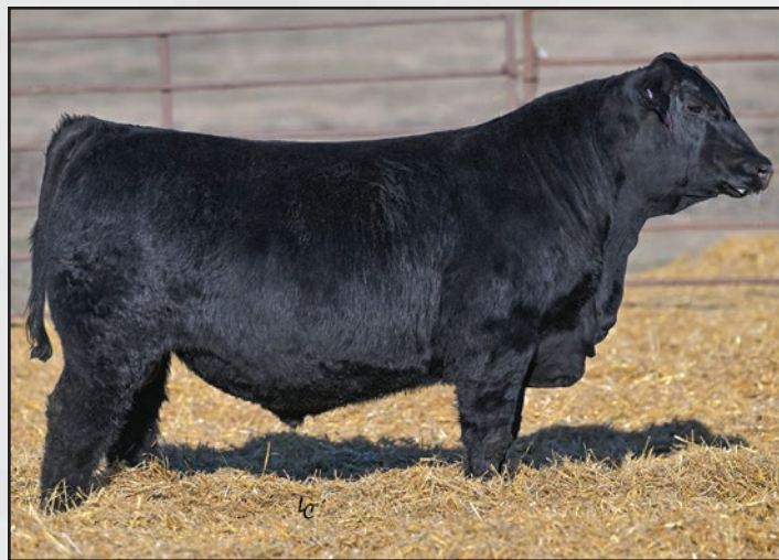
Lot 192, Ellingson Three Rivers 3477.