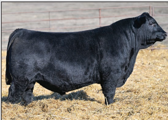
Lot 206, Ellingson Three Rivers 2843.