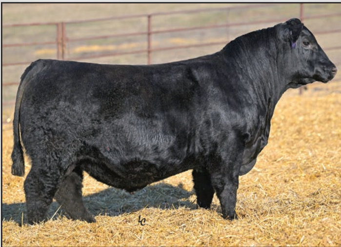
Lot 67, Ellingson Badlands 2816.