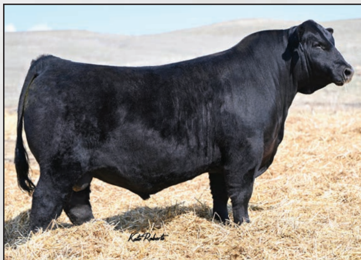
Ellingson Statement, a maternal brother to Lot 305.