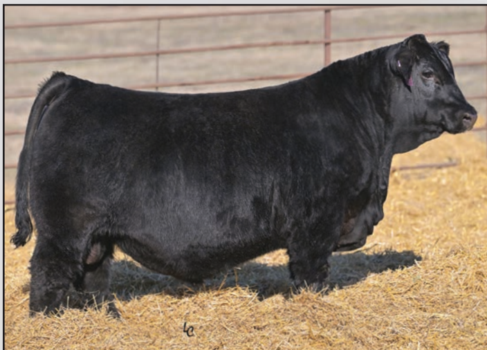
Lot 2, Ellingson Prolific 3091.