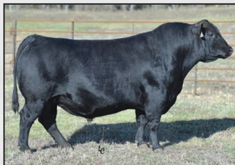
Ellingson Boardwalk 3032's influence sells.