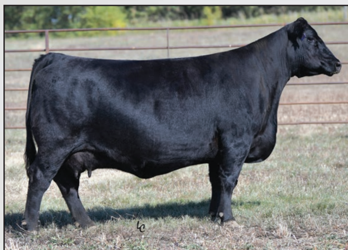
EA Bells Girl 7645, the dam of Lots 324 and 325 and a flush sister to the dams of Lots 326-330.