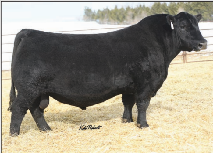
Ellingson Turn Key 0170, a flush brother to the dams of Lots 319 and 320.