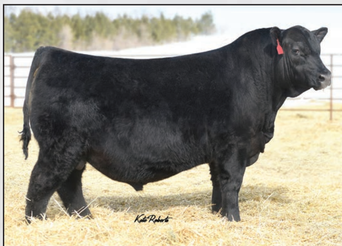
Ellingson Preeminent, a maternal brother to Lots 326-328.