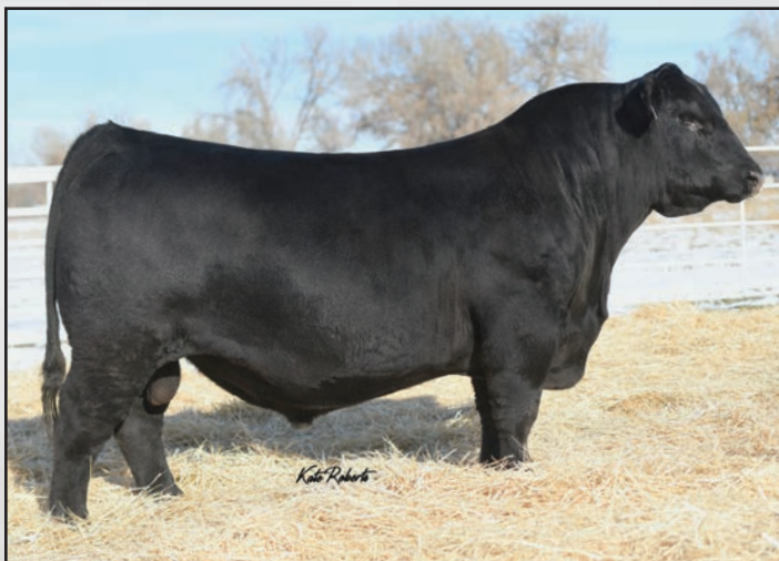
Ellingson Deep River, a maternal brother to Lot 20.