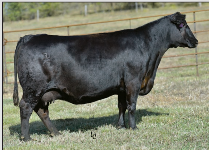
EA Lucy 2218, the great-granddam of Lots 341-343.