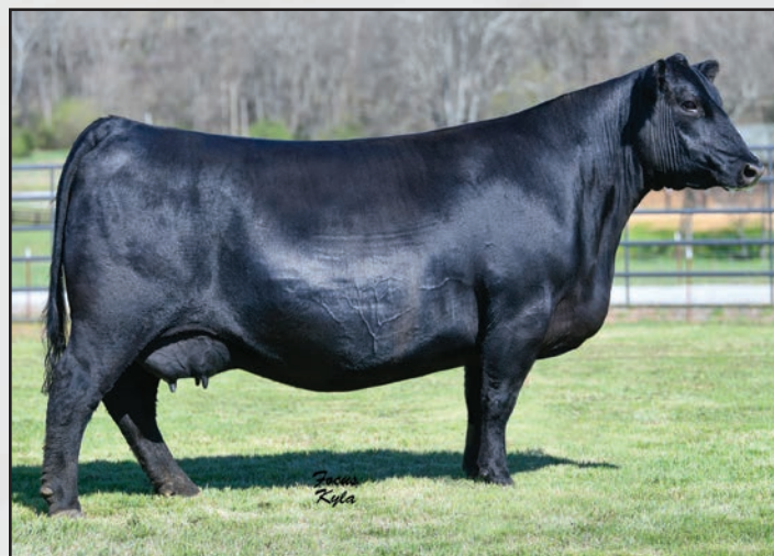
EA Hyalite Lady 1333, the granddam of Lots 164-172.