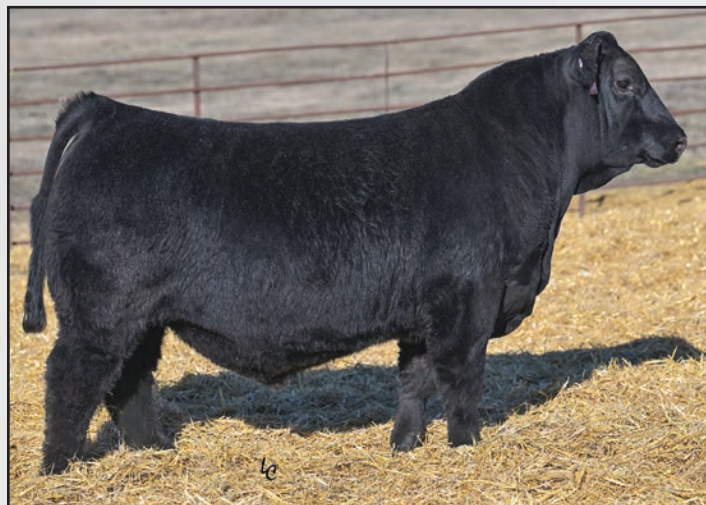
Lot 233, Ellingson Deep River 3265.

Produced from one of the most exciting up-and-coming females on the ranch, this Deep River son has been on our watch list since early on in his life. Ellingson Deep River 3265 is built with superb correctness. Being strong topped and standing down true and square to the ground allows him to travel with fluency while on the move. You will be hard-pressed to find another bull with his same moderate birthweight and high CED EPDs that can match his level of natural thickness and muscle expression. Lot 233's S Powerpoint WS 5503 dam will play a major role in our embryo transplant program moving forward. She is unlike any female we have ever worked with, as she has a special combination of antagonistic traits – superior fertility, structural correctness, carcass merit and phenotypic power. Six of the first seven generations of females behind his mother have achieved the coveted Pathfinder designation from the American Angus Association. Two of his maternal sisters have already been retained in our cowherd, with one of them arguably the top female of the entire 2023 calfcrop.