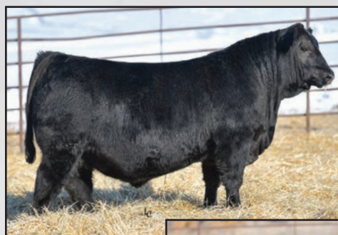
Left: Ellingson Barricade 2038, a full brother to Lot 112.