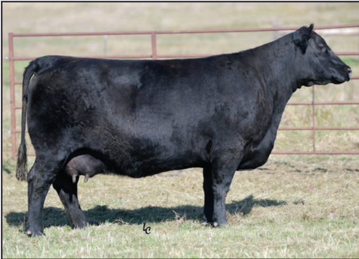
EA Miss Blackbird 5054, the maternal granddam of Lot 37.

Ellingson Badlands 3185 is one of many in his sire group that should be suitable for use on virgin heifers. His 2-year-old dam is a beautifully constructed female with added fleshing ability, femininity and a picture perfect udder. She is due with an early A.I. calf for this spring and is a maternal sister to the $65,000 Ellingson Turn Key 0170 and $20,000 Ellingson Bold, both of which are A.I. sires for our breeding program. His donor granddam ranks as one of the most productive and fertile females on our ranch and never fails to be a visitor favorite for her front-pasture maternal design.