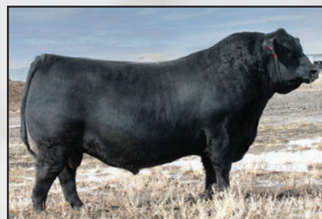
Ellingson Big River 0052, a flush brother to the dam of Lot 359.