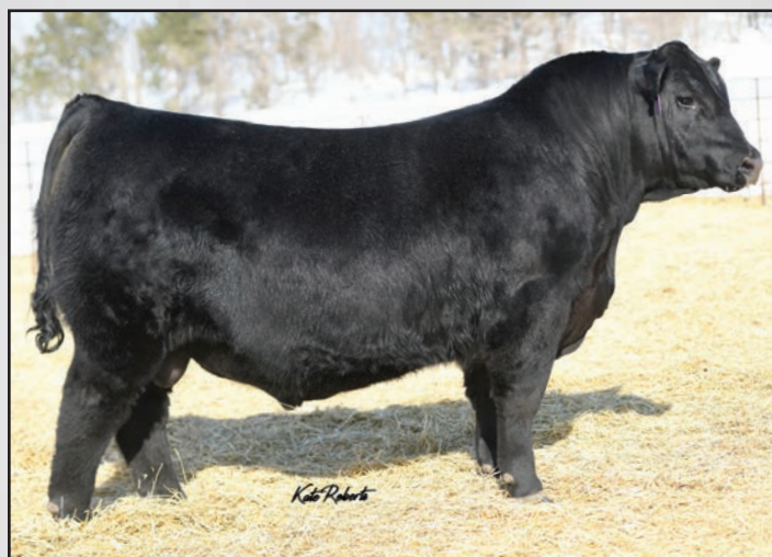
Ellingson Progressive, a maternal brother to Lot 104.