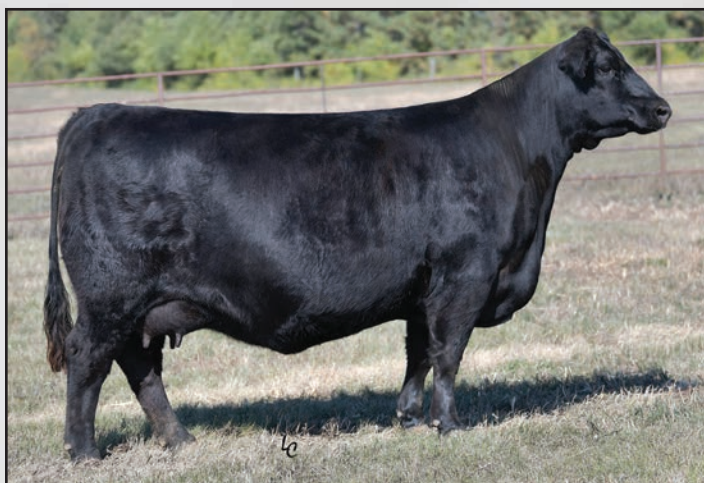
EA Queen 8070, the dam of Lots 224 and 225.