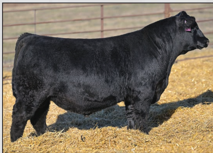
Lot 121, Ellingson Barricade 3049.

Here is one of the smoother profiling Barricade sons that has more extension through his front end. He is straight in his lines, soft centered and stands down true and square to the ground. This gives us a strong indication you will want to retain every one of his daughters. He should be suitable for utilization on virgin heifers.