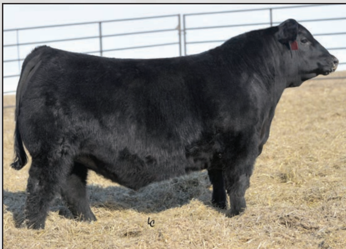
Ellingson Rough Terrain 9136, a full brother to the dam of Lot 265.

Here is a husky-built, stockman's bull that is designed in particular detail for commercial ranchers who sell their calves by the pound and have a cowherd that works for a living. Ellingson Thedford 3082 resembles the same phenotypic kind that have made the Roughrider sons in demand among commercial ranchers for many years. His dam is a full sister to the $30,000 Ellingson Rough Terrain 9136 at Northway Cattle Company that sired their high-selling sire group the last couple of years, as well as the dam of the $45,000 Ellingson Aquifer 9137 at Rust Mountain View Ranch.