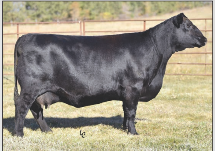
EA Madame Pride 3295, the maternal granddam of Lots 40 and 41.

Lot 38's genomic profile ranks him amongst the elite of the breed for weaning and yearling weight, scrotal circumference, foot quality, milk production, carcass weight and rib-eye area. Following in the footsteps of her Advance mother, his dam looks to be easy maintaining with strong udder suspension and small teat size. She is bred to have an early A.I. calf this spring. His granddam is a maternal sister to the $50,000 EA Emblynette 6279 donor, best known as the dam of Ellingson Three Rivers 8062.