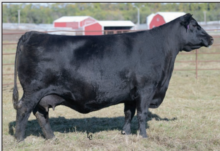
EA Queen Dolly 3246, the granddam of Lots 222 and 223.