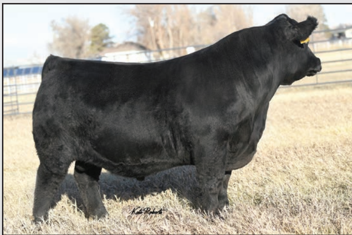
Ellingson Snapshot, the sire of Lot 366.