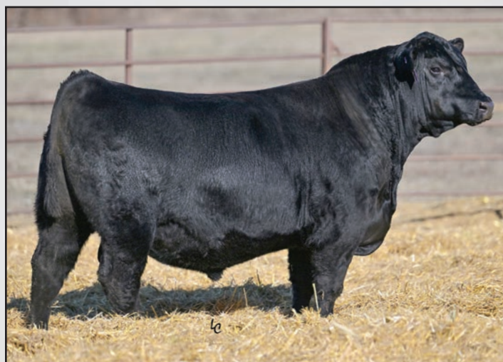
Lot 146, Ellingson Turn Key 2725.

Here is a rugged bull that stands down on more substance of bone and displays true three-dimensional shape. A maternal brother was the $11,500 selection of Steve and Kim Bruski in last year's sale. His dam is a maternal sister to Lot 144's dam.