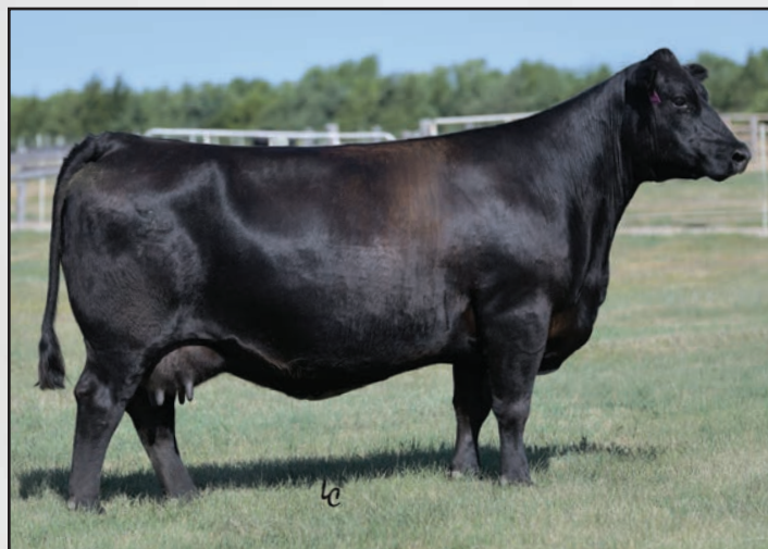
EA Bells Girl 2181, the matriarch dam of Lots 324-335.

Lot 332 is wide topped, smooth profiling and one you'll want to study in detail. He sports a phenomenal balanced EPD profile, stacking up amongst the best for weaning and yearling weight, docility, foot quality, PAP, heifer pregnancy, maternal calving-ease and ribeye area. His dam is a flush sister to the $25,000 Ellingson Proficient that sold to Kraye Angus and the Jerry Bennett Farm.