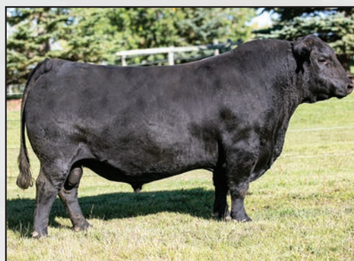
Ellingson Hi-Range, a full brother to Lots 94-96.