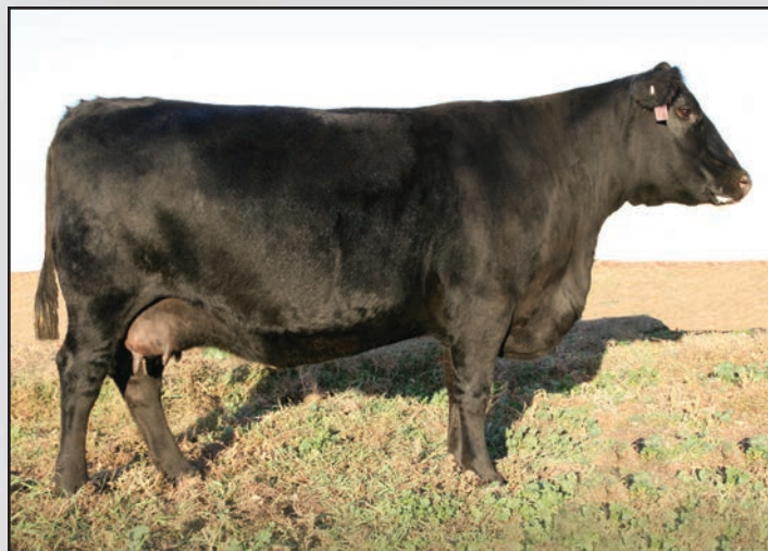
EA Emblynette 434, the granddam of Lot 190.

Lot 190's maternal brothers are working for Whitewater Cattle Company and Lower Brule Ranch. His dam by Advance has the eye-appealing, maternal presence that makes her hard to miss. As a coming 7-year-old, she has impeccable foot and udder quality and holds her condition well throughout the year.