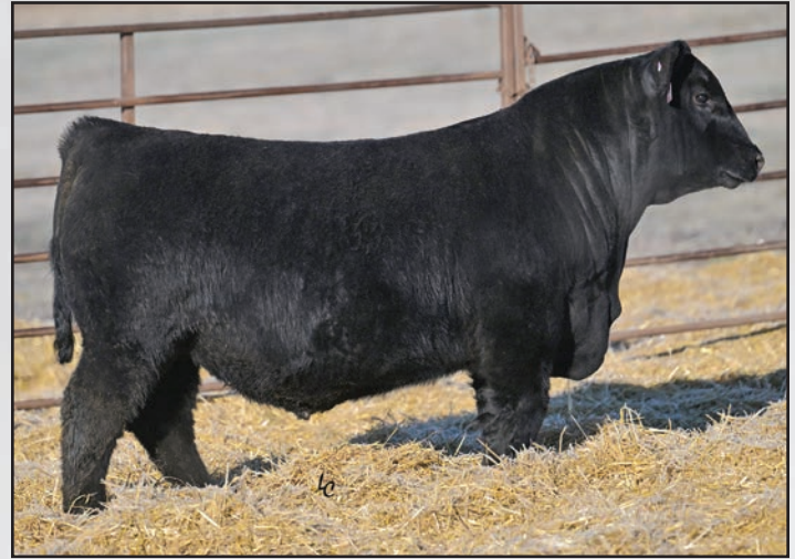
Lot 33, Ellingson Badlands 3210.