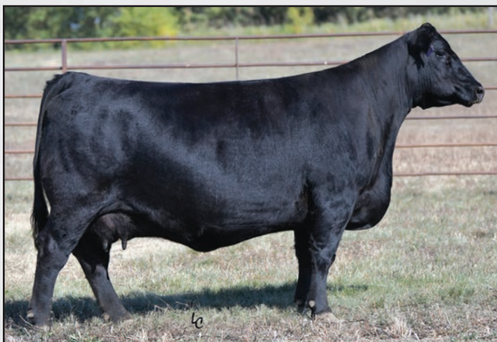
EA Bells Girl 7645, a flush sister to the dam of Lots 216 and 217 and maternal sister to the dam of Lot 218.

Ellingson Proficient 3518 is a stockmen's bull with the balanced-trait EPD package to drive genetic progress forward for nearly any cowherd that makes its living selling pounds of beef and having cows that work for a living. Ellingson Proficient 3518's donor dam by Ellingson Chaps 4095 and maternal granddam by Koupal Advance 28 are two of the most visually impressive females on the entire ranch and accompany those beautiful phenotypes with strong fertility and production. Lot 219's maternal brother by Ellingson Three Rivers 8062 was the $13,000 selection of Buford Ranches in last year's production sale, while four of his maternal sisters have been retained to work right here in our own cowherd. His Pathfinder donor granddam has posted a production birth ratio of 6/91, a nursing ratio of 6/105, a yearling ratio of 5/107 and a ribeye ratio of 5/103.