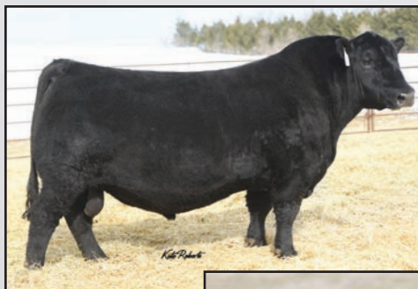
Left: Ellingson Turn Key 0170, a flush brother to the dam of Lot 53.