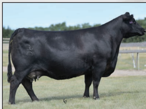
EA Hyalite Lady 4306, the maternal granddam of Lot 270.