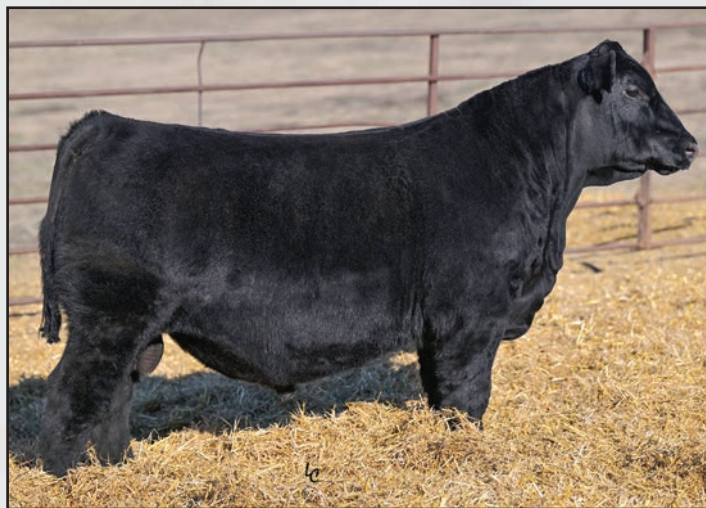
Lot 180, Ellingson Three Rivers 3454.