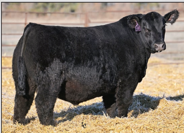
Lot 47, Ellingson Badlands 3164.