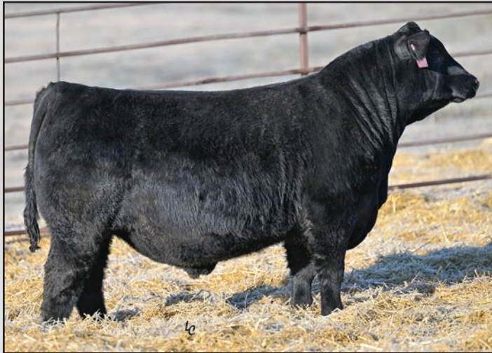
Lot 51, Ellingson Badlands 3458.

Here is a pair of deep-middled, calving-ease flush brothers that are expected to propel fertility and production merit. Their Three Rivers dam is a second-generation donor and has impeccable structural correctness. She has recorded a production birth ratio of 2/95, a nursing ratio of 2/104 and a yearling ratio of 1/110 and settled to first-service A.I. every year, despite being flushed aggressively. Their Pathfinder grandmother has a production birth ratio of 5/96, a nursing ratio of 5/107, a yearling ratio of 3/103 and a ribeye ratio of 1/111 and settled to first-service A.I. every year of her production career. Maternal brothers to them are featured as Lots 103, 317 and 318. A full sister is a favorite in our bred heifer pen. Lots 51 and 52 are flush brothers.