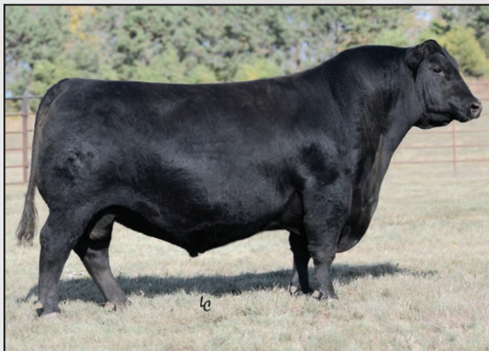
Ellingson Rider Pride 7282, the maternal grandsire of Lots 3-8.

The Prolific x Rider Pride combination has proven to be a huge success and is tailor made for commercial cattle producers that expect their cowherd to work for a living. You will appreciate the added volume, depth of flank and base width built into Lot 4's conformation. Stacking together some of the most problem-free sires we have ever utilized, this bull has Prolific, Rider Pride, Boardwalk, Traveler 004, Alliance 6595 and EXT all within his immediate lineage. His genomic profile ranks him among the elite in the population for weaning and yearling growth, scrotal circumference, claw and angle, heifer pregnancy, maternal calving-ease, carcass weight and ribeye area. With all that said, he is truly an individual that can add value to all segments of the beef industry. He is double-bred to the iconic EA Pride 346 donor dam that is best known as the mother of the $28,000 Ellingson Boardwalk 3032.