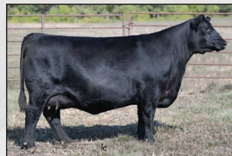
EA Emblynnette 9311, a maternal sister to the dam of Lot 287.