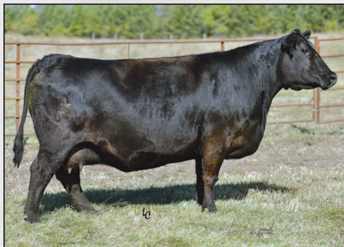
EA Primrose 9155, a maternal sister to the dam of Lot 163.