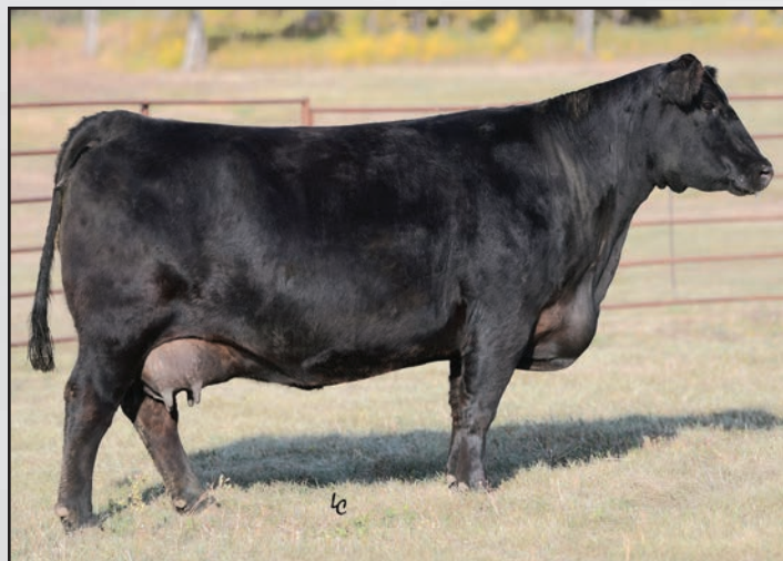
EA Emblynette 5365, the maternal sister to Lots 203-207 and the dam of Lot 208.