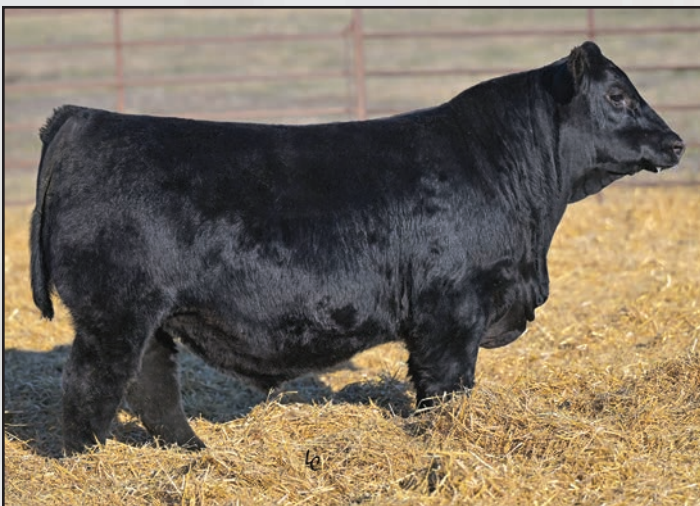
Lot 15, Ellingson Prolific 3215.

Lot 16 ties together two of the most sought-after herdsires ever produced at our ranch, Prolific and Three Rivers. His impressive, bulging crest, masculinity, added substance and natural dimension give him the look of a herdbull. He stays true to our goal of producing explosive early-growth cattle that mature into modest-sized animals. He ranks in the top 15 percent for weaning and yearling growth and the bottom 25 percent for mature size. His young dam has already posted a nursing ratio of 2/112 and settled with her third early-born calf due this spring. Her angularity, fleshing ease and structure replicate that of her mother, a productive contributor of this cowherd at age 11.