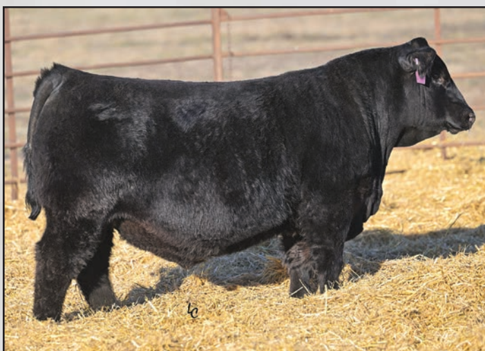
Lot 115, Ellingson Barricade 3203.