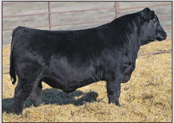
Lot 258, Ellingson Thedford 3051.

Ranking among the few best weaning and yearling weight EPD bulls of the entire offering, this Thedford son will put more dollars in your pocket on shipping day. He came off his dam at an actual weight of 865 pounds and earned a 107 weaning ratio. His Fundamental x Roughrider 2-year-old dam settled first service for an early A.I. calf.