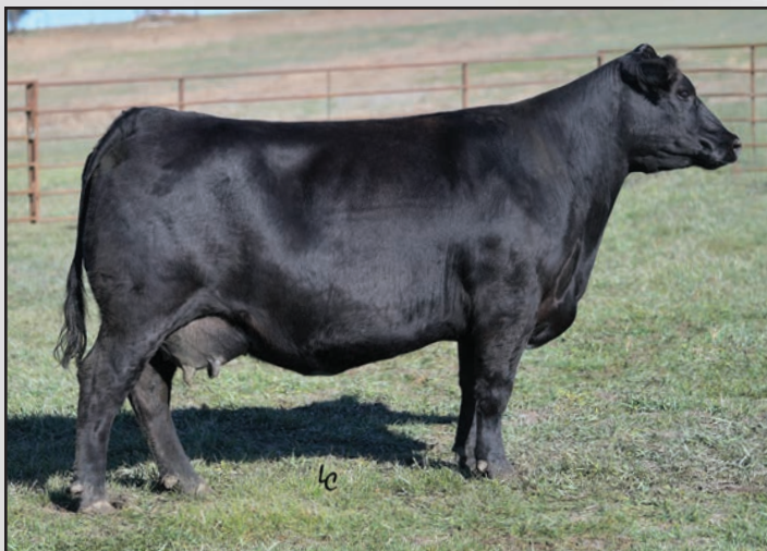
EA Blackclass 3142, the dam of Lot 23.