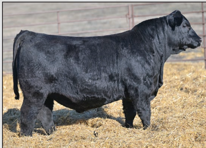
Lot 235, Ellingson Deep River 2983.

Wide muzzled and soft in their body type, these age-advantaged Deep River sons should be on your short list to find on sale day. Their donor dam is leaving an impactful mark on our cowherd with a production birth ratio of 4/92, a nursing ratio of 4/104 and a yearling ratio of 2/102. A maternal brother, Ellingson Practical 9122, was Lot 1 and the $19,000 feature of our 2020 sale. He went to Weers Angus, where he has grown into an impressive mature herdsire and is leaving a lasting impact on their cowherd. Another maternal brother is working for Jim and Darlene Swenson. Three maternal sisters have been retained in our cowherd. Lots 235 and 236 are flush brothers.