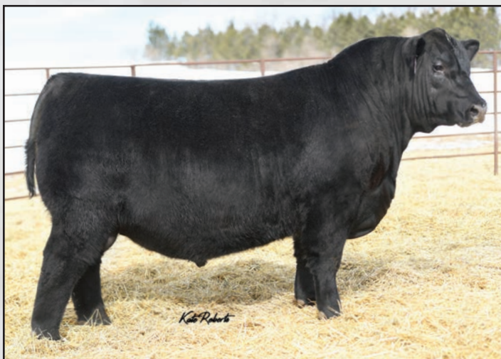
Ellingson Bold, a maternal brother to Lots 180-184