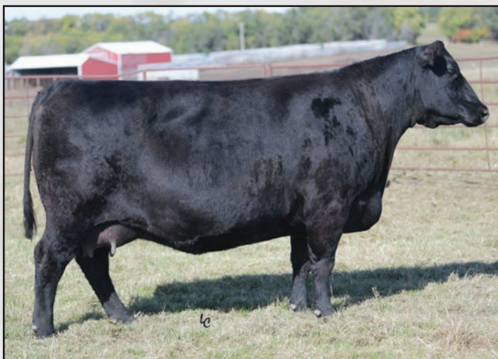
EA Primrose 2118, the dam of Lot 163.