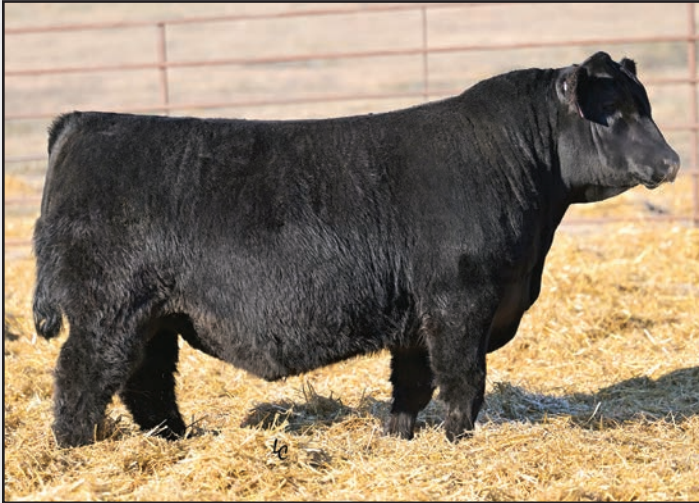
Lot 27, Ellingson Badlands 3031.

These brothers represent one of the most phenotypically impressive flushes we have ever produced. Their conformation, soundness, ideal growth curve, fertility and cow power programmed into their genes are tailor made for progressive commercial ranchers. Their Pathfinder dam is one of our most prolific embryo producers and has a nursing ratio of 4/106 and a yearling ratio of 2/104. She is a daughter of the Pathfinder sire Ellingson Transcend 5212, whose daughters are surfacing for production, fertility, correct body type and structural integrity. Their donor granddam has a nursing ratio of 7/108, a yearling ratio of 4/105, an IMF ratio of 4/103 and a ribeye ratio of 4/101. Eleven sisters have been retained in our cowherd, including a full sister that is Stetson's favorite in the bred heifer pen and a maternal sister that records a nursing ratio of 110 on her first two calves. Lots 27-33 are flush brothers.