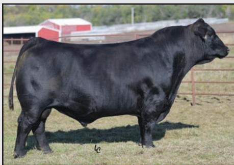
Ellingson Homegrown 6035's influence sells.