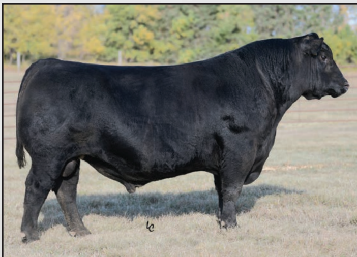
Ellingson Authorize 7057, the maternal grandsire of Lots 115-120.