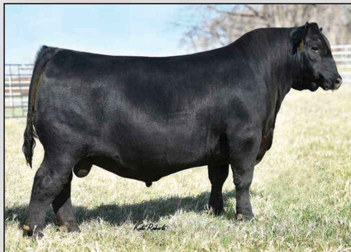
Ellingson Rush, a maternal brother to the dam of Lot 107.