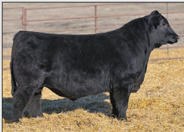
Lot 317, Ellingson Pilot 3006.

We're excited to present the first Pilot sons. They offer a new-generation pedigree anchored by a maternal ancestry on the top and bottom sides. This pair of embryo transplant brothers show off an elite EPD spread from birth to yearling. Their Three Rivers dam is a second-generation donor and has impeccable structural correctness. She has a production birth ratio of 2/95, a nursing ratio of 2/104 and a yearling ratio of 1/110 and settled to first-service A.I. every year, despite being flush aggressively. Their Pathfinder grandmother has a production birth ratio of 5/96, a nursing ratio of 5/107, a yearling ratio of 3/103 and a ribeye ratio of 1/111 and settled to first-service A.I. every year. Maternal brothers to the bulls are featured in this sale as Lots 51, 52 and 103. A maternal sister is a favorite in our bred heifer pen. Lots 317 and 318 are flush brothers.