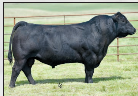
CTS Remedy 1T01's influence sells.