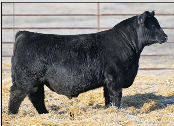
Lot 55, Ellingson Badlands 3300.