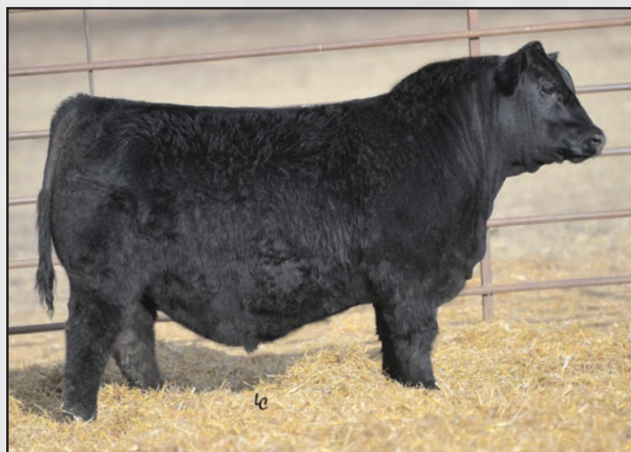
Ellingson Roughrider 9026, a maternal brother to Lot 344 and to the dam of Lot 345.

Make sure to keep every female from Lot 345. His sire's type and kind matched with the females that anchor the bottomside of his pedigree create a recipe for long-lasting, productive females. Six of the first seven generations of females behind Lot 345's dam have achieved Pathfinder status. Two sisters have been retained in our cowherd. A flush sister is likely the top heifer of the 2023 calfcrop.