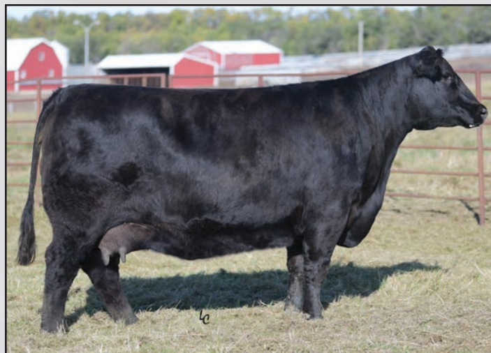
EA Primrose 5083, the dam of Lot 20.