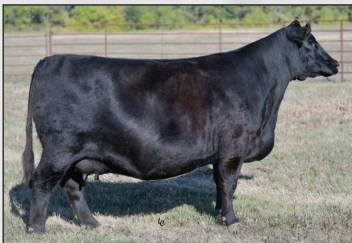
EA Blackclass 8207, the dam of Lot 232.