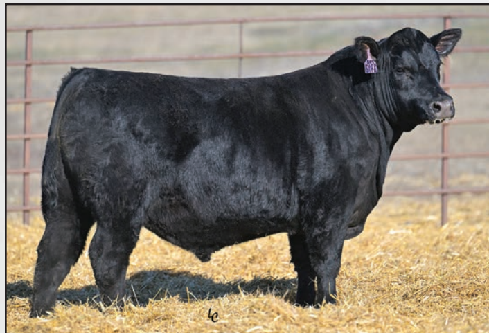
Lot 222, Ellingson Profound 2710.

These royally bred flush brothers pair together two of the most commercial-friendly lines of cattle you find in the industry today, Profound and Roughrider. Like you have come to expect from both of these lines, these fall-born brothers are robust in their rib shape and ripped with muscle throughout. They travel with authority on the move and have the stellar foot design and heel depth their sire and his sons have become synonymous with. Their dam by Ellingson Roughrider 4202 is the only full sister in existence to Ellingson Rider Pride 7282, the high-selling bull in our 2018 production sale that was selected by Peak Dot Ranch, Wright Cattle and Van Zee Cattle, and Ellingson Teddy 9369, a top-selling feature in our 2020 sale that was selected by Eaves Angus Genetics and has quietly done a stellar job for them. EA Queen Dolly 9364 is easy keeping. She has a wedge shape, elegant femininity and a true maternal presence. Lots 222 and 223 are flush brothers.