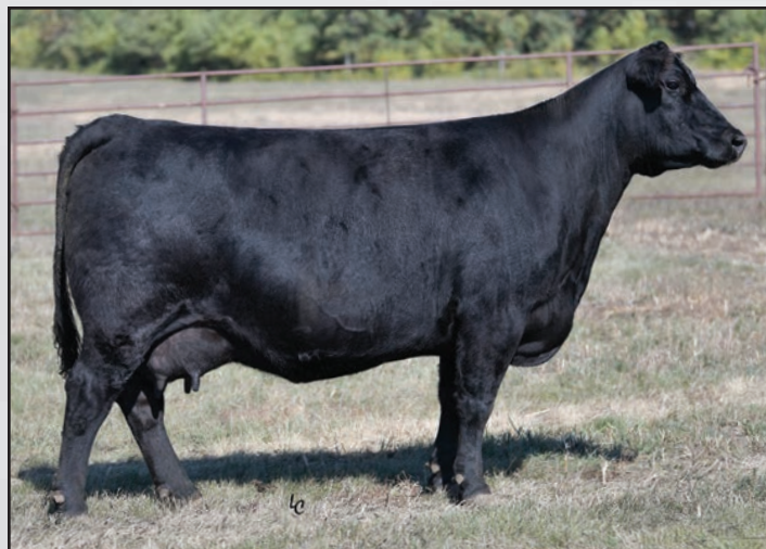
EA Bells Girl 7617, the dam of Lots 326-328 and a flush sister to the dams of Lots 324, 325, 329 and 330.

The Pathfinder dam of these three flush brothers needs no introduction to anyone that knows our program. She has produced numerous headlining sons, including the $80,000 Ellingson Badlands 0285, the $85,000 Ellingson Brickhouse, the $110,000 Ellingson Preeminent and the $50,000 Ellingson Progressive. She has recorded a production birth ratio of 5/100, a nursing ratio of 5/106, a yearling ratio of 3/110, an IMF ratio of 11/110 and a ribeye ratio of 11/104 and settled to first-service A.I. every year of her career. They are full brothers in blood to Lots 324, 325, 329 and 330. Lots 326-328 are flush brothers.