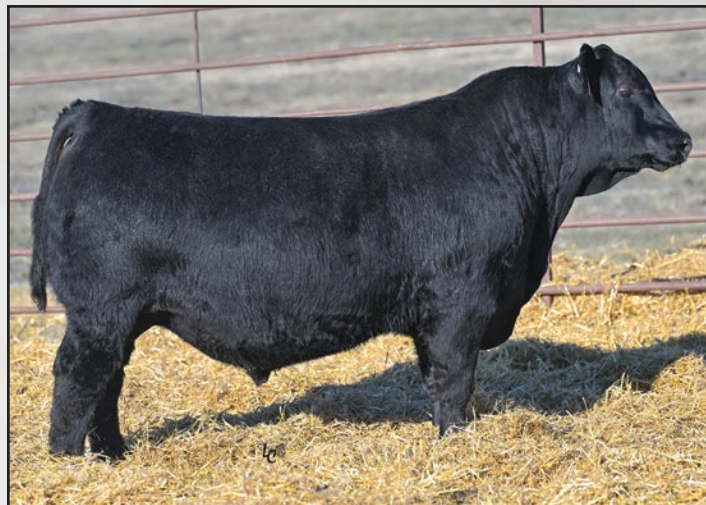
Lot 135, Ellingson Turn Key 3147.

The Turn Key sons were the highest averaging sire group in last year's sale, embraced by both the commercial and purebred sectors alike. We can think of no more fitting way to lead this year's set of Turn Keys off than with what may be his best son to date. You will appreciate the masculinity and overall correctness Lot 135 exhibits in person. The cow power that backs him up is second to none, with seven of the first eight dams of his maternal lineage having reached the pinnacle of Pathfinder status. His dam has recorded a production nursing ratio of 5/109, a yearling ratio of 4/104, a ribeye ratio of 2/111 and a 362-day calving interval, having settled to first-service A.I. every year of her production history so far. She is a maternal sister to the $50,000 co-top-selling bull of our 2016 production sale, Ellingson Top Shelf 5050, who went on to make positive contributions for Hoffman Ranch and Semex Beef. His maternal brothers have also highlighted past sale offerings, selling to Rodney Schatz and Ottmar Ranch.