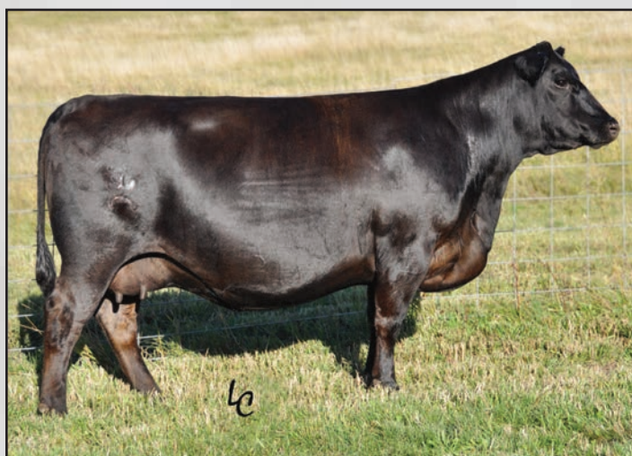
EA Evergreen 7832, the great-granddam of Lot 154.