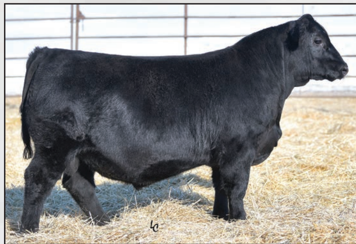
Ellingson Profound 2022, a maternal brother to Lots 216 and 217.