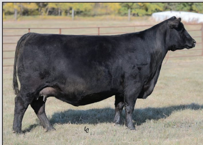
EA Emblynnette 7480, the granddam of Lot 158.