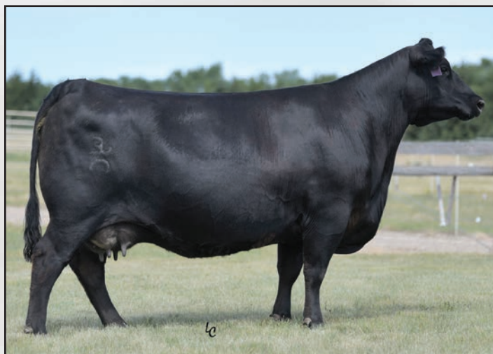
EA Hyalite Lady 4306, the dam of Lots 164-172