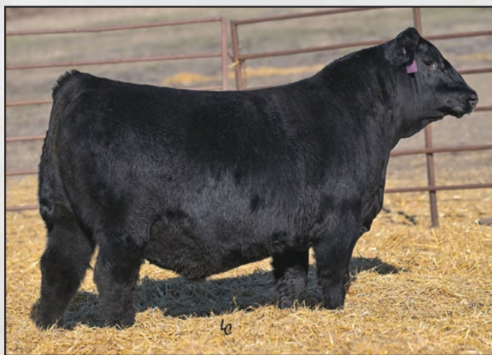
Lot 122, Ellingson Barricade 3059.