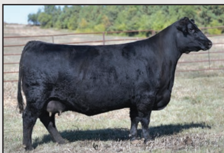
EA Lucy 8164, the dam of Lot 358.

Even as one of the youngest bulls in the sale, Lot 358 has been a favorite of Stetson's throughout the summer alongside his donor dam and into the winter on test. He has an abundance of red meat and is the cowboy's kind. His Juneau 797 dam has a jaw-dropping look and stems from the Lucy line that produced LT Territory 5824 of EA. Maternal brothers are being sold in the sale as Lots 341-343.