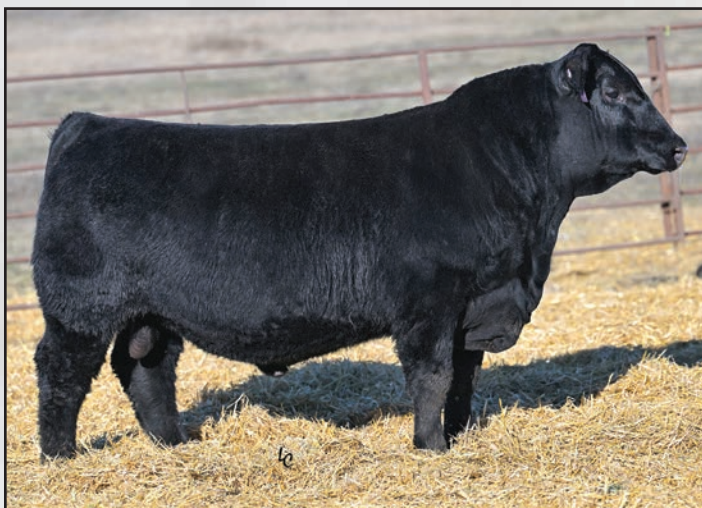
Lot 191, Ellingson Three Rivers 3509.