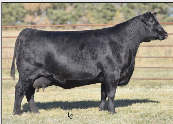
EA Primrose 3149, the dam of Lot 143.