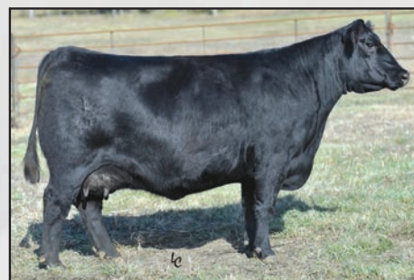
EA Blackclass 0083, the granddam of Lots 177-179.