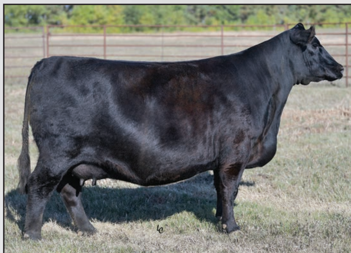
EA Blackclass 8207, a maternal sister to Lots 177-179.