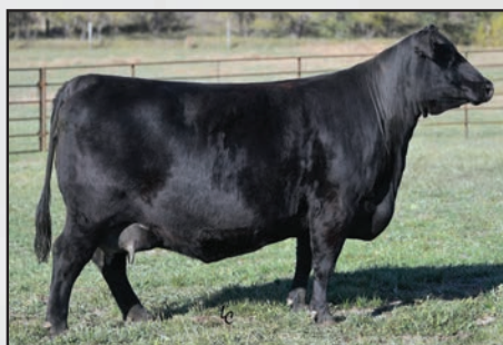
EA Blackclass 5350, the dam of Lots 177-179.