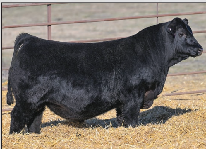
Lot 111, Ellingson Barricade 3469.