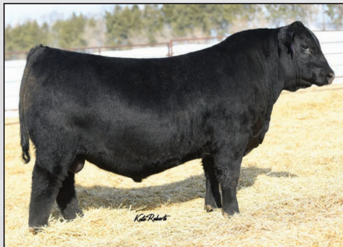
Ellingson Navigator, a maternal brother to the dam of Lot 142.