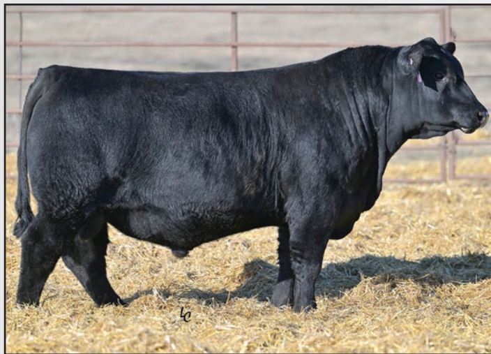
Lot 177, Ellingson Three Rivers 2701.