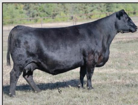
EA Madame Pride 8083, the dam of Lot 277.