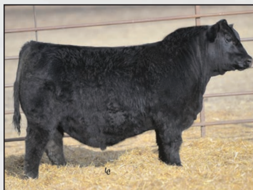
Ellingson Roughrider 9026, a maternal brother to the dam of Lot 233.