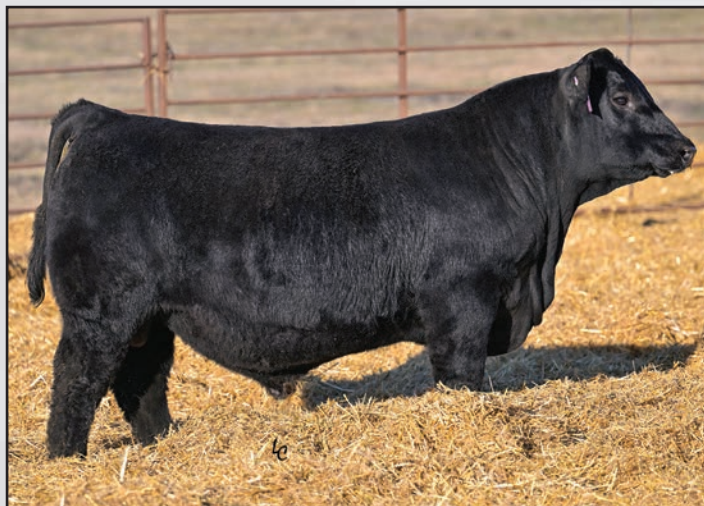
Lot 3, Ellingson Prolific 3218.