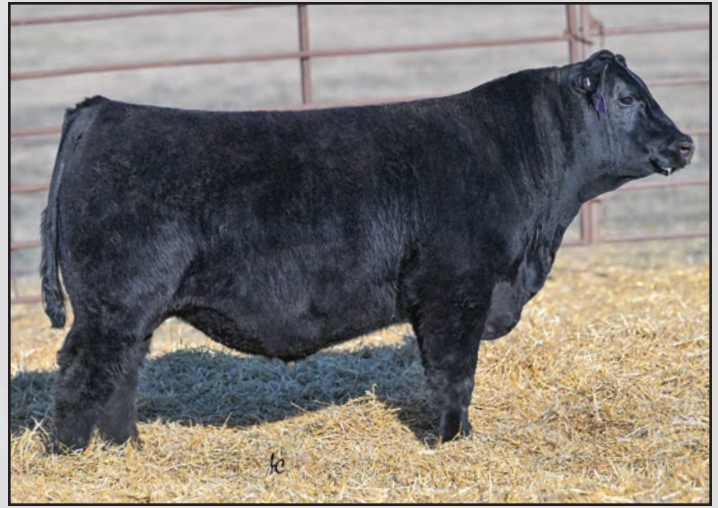
Lot 50, Ellingson Badlands 3208.

This no-holes Badlands son is especially correct in his build and offers exceptional maternal-siring capabilities – traits we go the extra mile to program into every bull. He offers added carcass merit, ranks in the top 20 percent of the breed and earned the coveted CAB logo stamp on his pedigree. His dam was one of our favorite 2-year-olds we calved this spring. After her first year of work, she looks to be holding her flesh well and ultrasounded with another early A.I. calf due this spring. Much like her mother and maternal sisters, she is elegant in her makeup and has lots of depth of flank and a picture-perfect udder.