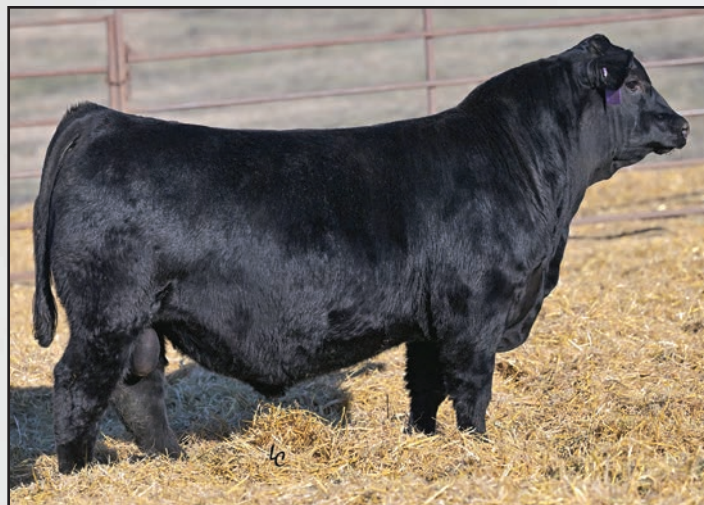
Lot 94, Ellingson Rangeland 3311.

This trio of ET brothers is slated to be a highlight of the sale. They are full brothers to the $160,000 second-top-selling bull of our 2022 production sale, Ellingson Hi-Range, owned in conjunction with Hamilton Farms and MWC Investments. The first Hi-Range progeny in Canada have garnered rave reviews from even the most scrutinizing cattlemen and women. Some daughters have already highlighted national Canadian sales, including one that sold for $50,000 at the Agribition. This flush offers the same elite-caliber phenotype and data set that have made their brother a sensation. Their outcross, yet proven, pedigree offers unlimited mating potential. Their donor dam has recorded a production birth ratio of 3/90, a nursing ratio of 3/107 and a yearling ratio of 1/105. She will play a major role in our breeding program moving forward with many ET progeny due this spring. Lots 94-96 are flush brothers.