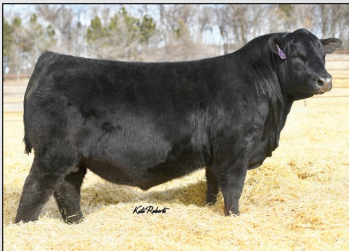
Ellingson Prolific, a maternal brother to Lots 237 and 238.