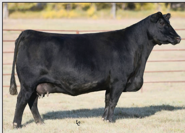
EA Abigale 6207, the granddam of Lots 9-11 and 13.