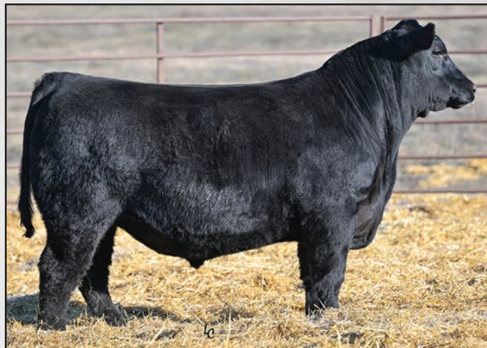
Lot 298, Ellingson Powerpoint 2822.