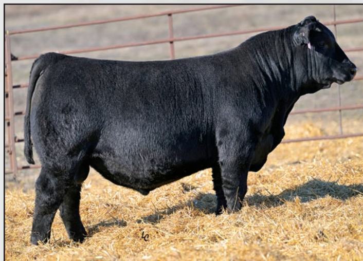
Lot 159, Ellingson Turn Key 2990.