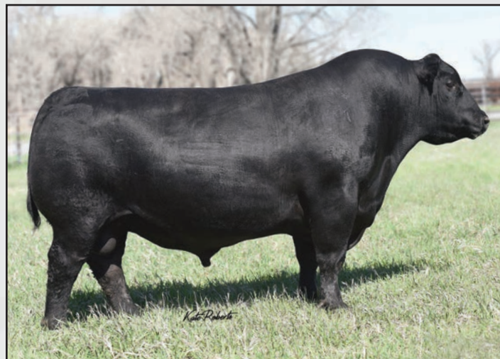
Ellingson Roughrider 4202, the maternal grandsire of Lots 9-12.