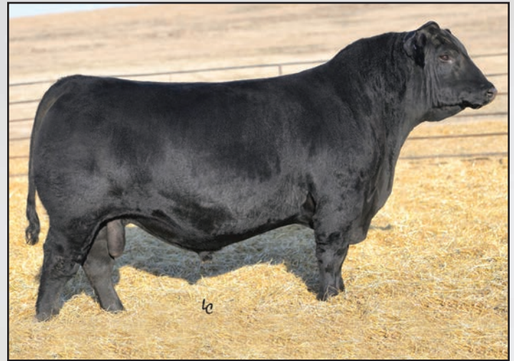
Ellingson Three Rivers 8062, the maternal grandsire of Lots 51-59 and a full brother to the dam of Lot 60.

Ellingson Badlands 2803's genomic profile ranks him amongst the breed's top tier for maternal calving-ease, foot quality, hair shedding, heifer pregnancy, carcass weight and ribeye area. His now 3-year-old Three Rivers dam calved early in the season again this past fall and has a beautiful full sister to him alongside her.