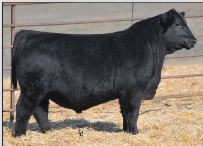
Ellingson Proficient, a flush brother to the dam of Lot 101.