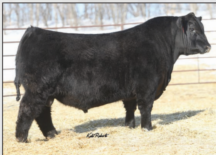
Ellingson Uncharted, produced from a maternal sister to Lot 24.

The Prolific sire group is one of the most consistent groups ever produced at our ranch with deep quality stacked in from the first bull through the last. You will appreciate the substance of bone and muscle expression this bull exhibits. His angular, structurally correct dam has the makings to be a female that will last for years to come. A maternal brother was selected by Lower Brule Ranch in last year's production sale.