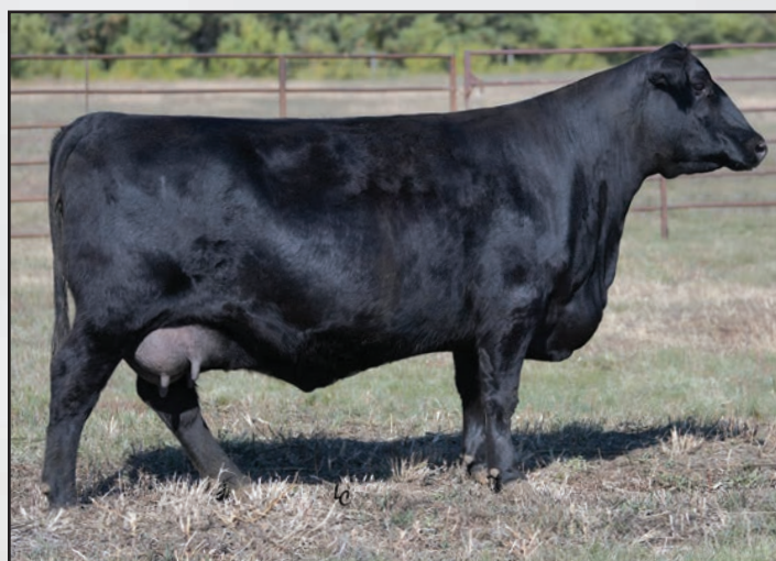
EA Blackclass 8306, the dam of Lot 196.

Ellingson Three Rivers 3058 has been in a performance class of his own. His added size, length of body, substance and natural thickness will lend kindly in siring calves that will weigh heavy in the fall and have an appetite for gain in the feedlot. His second-generation Pathfinder dam has recorded a production nursing ratio of 4/110, a yearling ratio of 2/110, an IMF ratio of 2/109 and a 364-day calving interval. She is slated to earn the Pathfinder award again in only her second year of being eligible. She earned a spot on our donor roster this past spring. His maternal brother, Ellingson Profound 2125, was a $22,000 feature in last year's sale, selling to Lindskov's LT Ranch. After covering cows throughout the summer and holding his condition very well, he has been collected and included in their fall program via A.I. Another maternal brother is working for Gottsch Cattle Company.