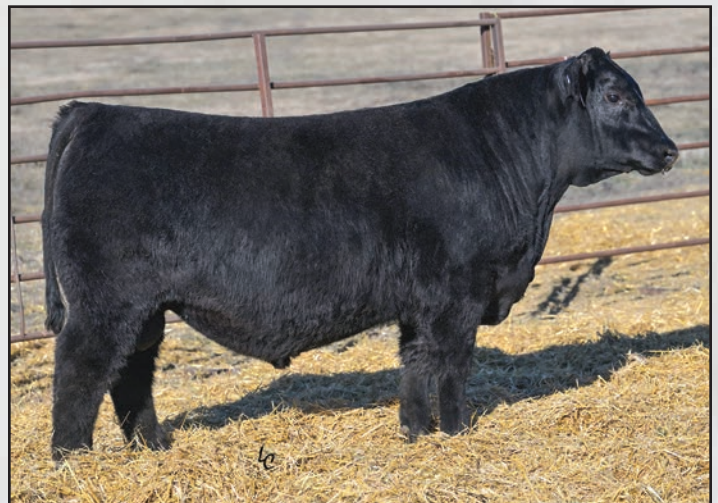
Lot 321, Ellingson Pilot 3390.

This bull is out of what we consider to be one of the best up-and-coming cows on the ranch. She is a flush sister to the $65,000 Ellingson Turn Key 0170 and will have a large volume of embryo calves born at the ranch this spring. She is a second-generation donor and has a production birth ratio of 2/100, a nursing ratio of 2/107 and a yearling ratio of 1/107. She is due back for a first-service A.I. calf. His flush sisters rank among the very best females in our replacement pen, which should foreshadow what could become of his own daughters. He is a full brother in blood to Lot 319.