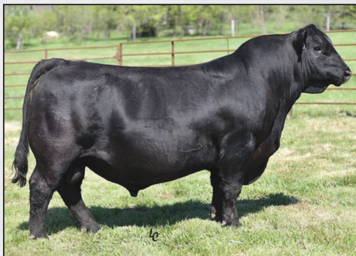
Ellingson Transcend 5212, a maternal brother to the dam of Lots 164-172.