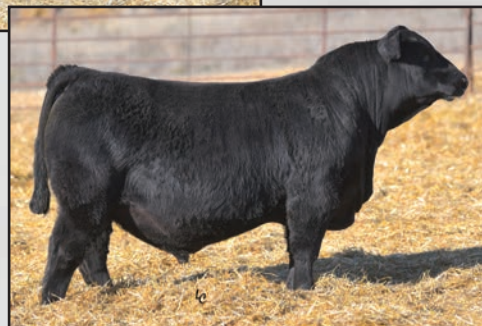
Right: Ellingson Barricade 1090, a full brother to Lot 112.