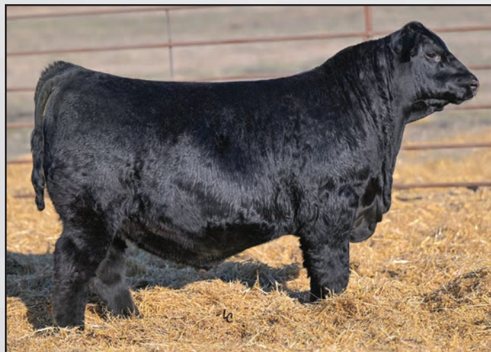
Lot 112, Ellingson Barricade 3035

When a certain mating works, it doesn't make sense to change it. That's why we have continued to replicate it in this bull's case. Two of his full brothers have been special sale attractions in our past two sales – one going to Buford Ranches for $37,500 and the other to Larry Rice for $26,000. Lot 112 has the same eye-catching conformation and performance record of his standout brothers. His Pathfinder dam boasts a flawless production record with a birth ratio of 5/100, a nursing ratio of 5/110, a yearling ratio of 4/108, an IMF ratio of 3/106, a ribeye ratio of 3/109 and a 362-day calving interval, having settled to first-service A.I. every year of her career. She is safe in calf with a pair of twin bulls due early to Barricade yet again.