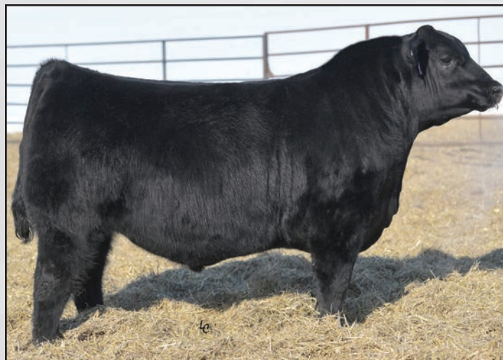
Ellingson On Point 9079, the sire of Lots 314-316.

Ellingson Powerpoint 2906, a Powerpoint son out of an Ellingson Top Shelf 5050 dam, traces to the $52,000-valued EA Pride 346 donor that is the dam of Ellingson Boardwalk 3032 and one of the best cows to have ever walked our pastures. A maternal brother was selected by Oeltjen Farms in our 2022 sale.