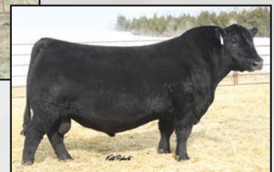
Ellingson Turn Key 0170, a maternal brother to Lots 213-215.