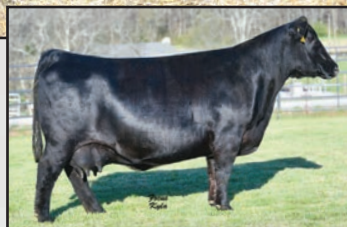
Left: EA Emblynette 1195, the great-granddam of Lot 272.