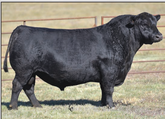
Koupal Advance 28, the maternal grandsire of Lots 177-190.