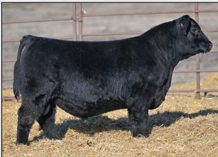
Lot 97, Ellingson Rangeland 3163.

Lot 97 epitomizes what common-sense practicality in beef production should look like. The more you study him in the flesh and on paper, the more you come to appreciate him. His genetic profile ranks him among the best of the Angus population for weaning weight, foot quality, PAP, heifer pregnancy, maternal calving-ease and carcass weight. He is smooth profiling and sharp fronted, yet is still an individual you can easily see lots of natural dimension in. His dam is a three-quarter sister to the $175,000 Ellingson Prolific at ST Genetics. She is elegant in her design with added fleshing ability and a near-perfect udder. His dam is a full sister to a $27,500 feature in 2022 that sold to Skull Creek Ranches. Other full and maternal brothers to her are working for Gordon Benson, Landon Davis, Whitewater Cattle Company, Elk Meadows Ranch, Michael Nathe, Lower Brule Ranch, Penhros Farms and Buford Ranches, which has two.