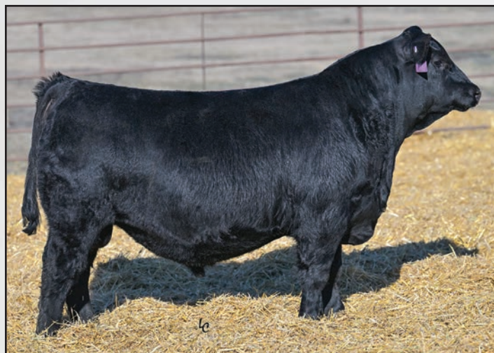
Lot 253, Ellingson Thedford 3048.

We're committed to utilizing bulls bred in our program in mass fashion to build an added degree of predictability in our offering. We incorporate an outcross sire that possesses the same values we prioritize in our own cowherd from time to time with the goal of producing a new-generation herdsire. We feel we have accomplished that feat in this special sale highlight. Lot 253 has ran a strong performance race, even after starting out at a heifer-safe birth-weight. He came off his 2-year-old dam at 940 pounds to earn a 115 weaning ratio. His explosive early growth curve is rooted in strong maternal tradition. His modest-sized Rangeland dam is elegantly designed with superb structural integrity and due back with an early A.I. calf. Her Pathfinder dam is a flush sister to the dam of Badlands, Brickhouse, Preeminent and Progressive. She serves on our donor roster and has a production nursing ratio of 5/109, a yearling ratio of 3/108, an IMF ratio of 5/110 and a ribeye ratio of 5/104. Phenotypically, he may be one of the most impressive and structurally correct bulls we have raised. His outcross pedigree and combination of economically relevant traits make him a definite A.I.-caliber candidate.