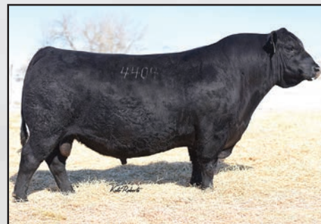
Basin Rainmaker 4404's influence sells.