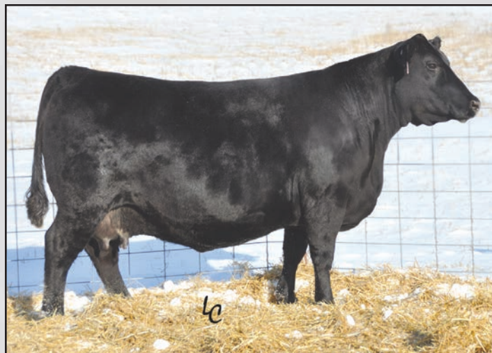
EA Pride 346, the maternal anchor of the pedigrees of Lots 4 and 5.