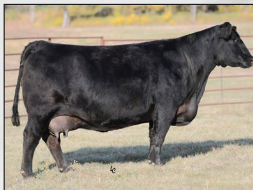
EA Emblynette 5365, the granddam of Lot 298.