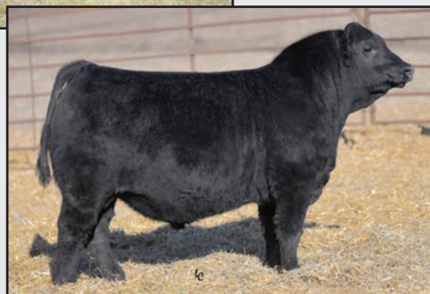
Right: Ellingson Practical 9122, a maternal brother to Lots 235 and 236.