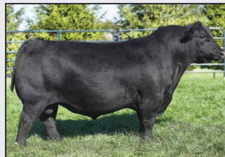
S Powerpoint WS 5503's influence sells.