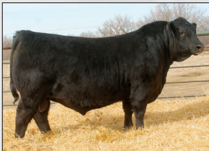
Ellingson Big River 0052, a maternal brother to Lots 263 and 264.