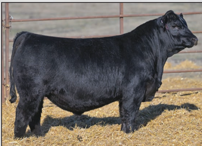
Lot 260, Ellingson Thedford 3456.

This negative-birthweight EPD and double-digit CED Thedford son should be utilized on virgin heifers to sire calves that come easy and have an added dose of vigor to find colostrum immediately following birth. You will appreciate his authentic Angus breed character, definitive muscle pattern and fleshing ease. His dam is a maternal sister to the $65,000 Ellingson Turn Key 0170 and $20,000 Ellingson Bold. Both bulls are being utilized back in our A.I. and E.T. programs.