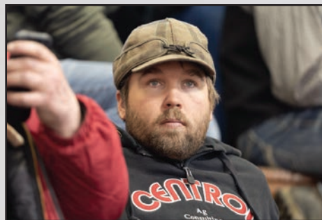
Penhros Farms owns maternal brothers to Lot 208 and 212.