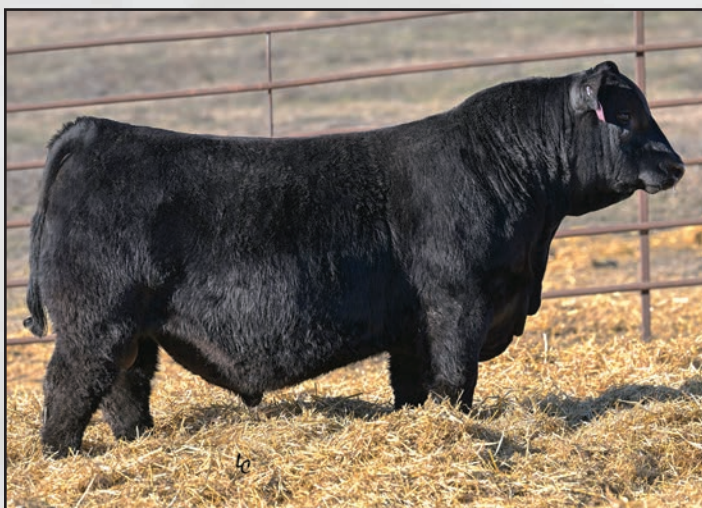
Lot 21, Ellingson Prolific 3027.

Ellingson Prolific 3027 ranks as one of the stoutest muscled and most visually impressive bulls of the offering. His strong top, fluent movement, ideal heel depth and impeccable claw structure are nothing short of amazing and should allow him to be a positive contributor to any breeding program. His Rainmaker 4404 dam is one of the exciting up-and-coming matrons of our cowherd, already having produced the $16,5000 Ellingson On Star 1013, the lead herdsire at 12 Star Ranch. She has recorded a stellar nursing ratio of 2/109, a yearling ratio of 1/103 and an IMF ratio of 1/134 and is due for an early A.I. calf by Prolific this spring.