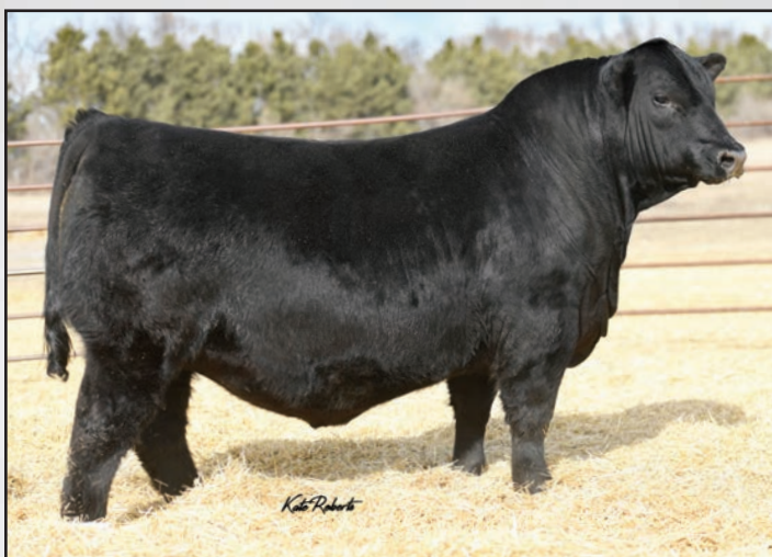
Ellingson Brickhouse, a maternal brother to Lot 104.