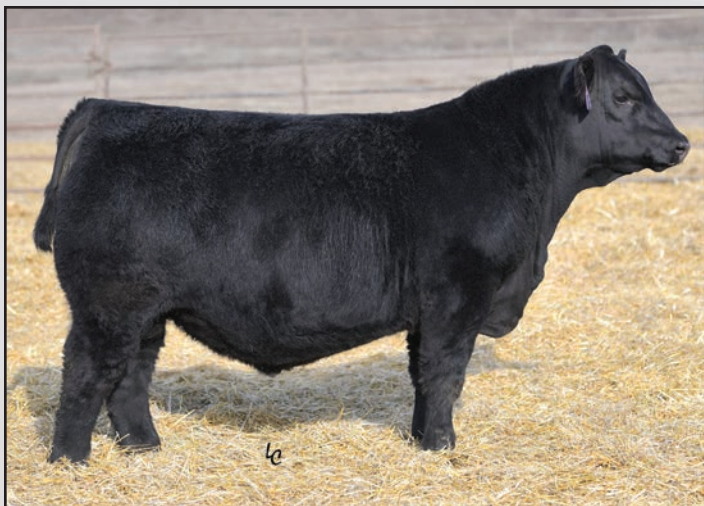
Ellingson Three Rivers 0312, a maternal brother to Lot 239.