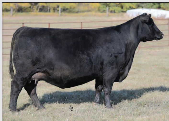
EA Emblynette 7480, the dam of Lot 239.