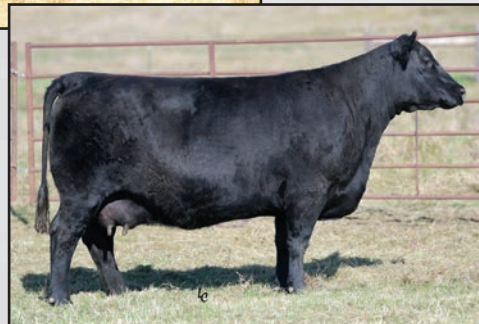
Right: EA Miss Blackbird 5054, the granddam of Lot 53.