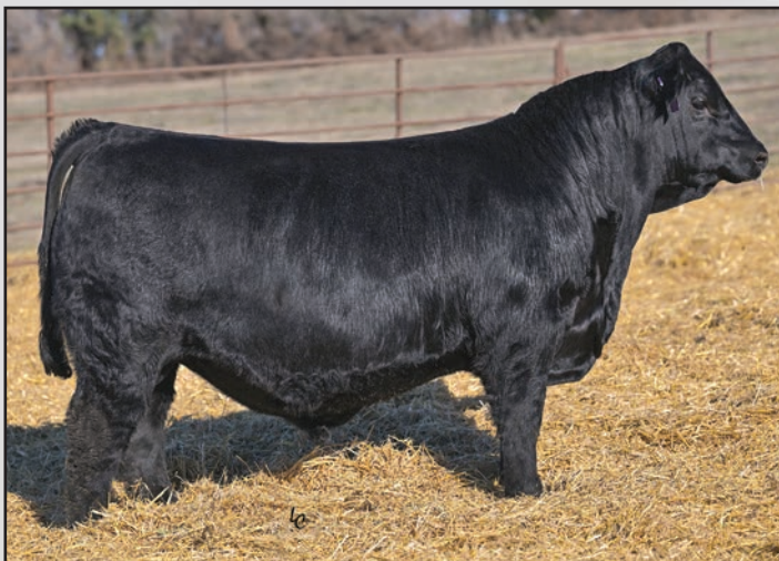
Lot 262, Ellingson Thedford 3100.