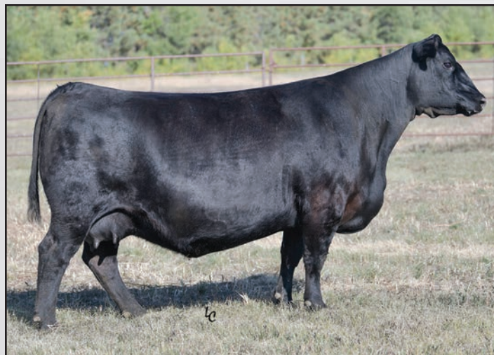
EA Madame Pride 8083, the maternal sister to Lot 24.