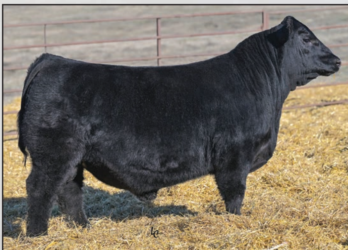
Lot 323, Ellingson Pilot 3129.