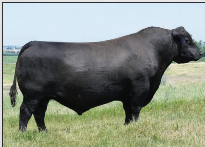
Ellingson Aquifer 9137, a maternal brother to Lot 363.