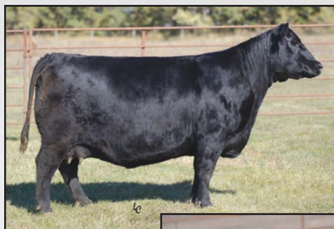
Left: EA Blackclass 4024, the granddam of Lots 235 and 236.

Ellingson Deep River 3028's dam by Powerpoint is a powerhouse individual with impeccable foot quality. She has recorded a production birth ratio of 4/100, a nursing ratio of 4/101, an IMF ratio of 3/152 and a ribeye ratio of 3/104. She has a 360-day calving interval, having settled to first-service A.I. every year of her production career thus far. Maternal brothers are working for A5 Cattle Company, Kirkland Ranch and Kyle Wyly. This is a three-quarter brother to Lot 233.