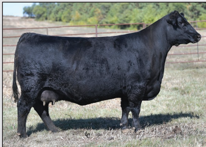
EA Lucy 8164, the dam of Lots 341-343.