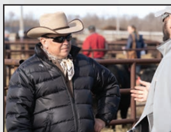
Diede Ranch (left) and Prairie Diamond Ranch are among those who have selected maternal brothers to Lot 197.