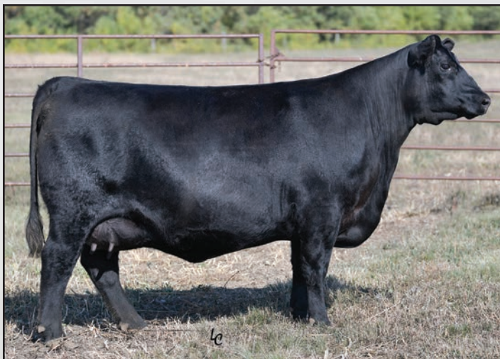
EA Emblynette 9311, the dam of Lot 198.

"The best way to predict your future is to create it."