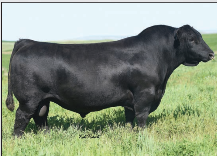
Ellingson Chaps 4095, a maternal brother to the dam of Lot 299.