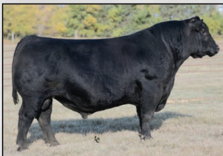
Ellingson Authorize 7057's service sells.