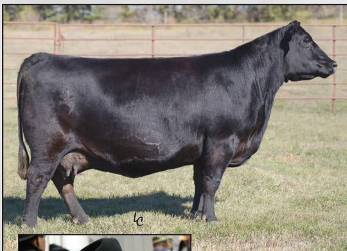
Above: EA Queen Dolly 2133, a granddam of Lot 301.