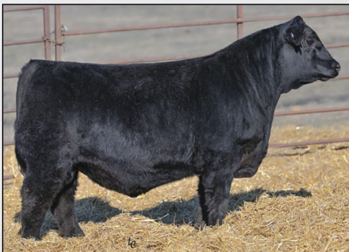
Lot 336, Ellingson Pilot 3476.

Deep sided and assembled with more pounds of red meat, these five flush brothers will sire heavy feeder calves and daughters that keep you in the business for the long haul. Their Pathfinder dam is one of our most prolific embryo producers and earned a production nursing ratio of 4/106 and a yearling ratio of 2/104. She is a daughter of Ellingson Transcend 5212, the Pathfinder sire whose daughters are beginning to surface above their contemporaries for production, fertility, correct body type and structural integrity. Their donor granddam has a production nursing ratio of 7/108, a yearling ratio of 4/105, an IMF ratio of 4/103 and a ribeye ratio of 4/101. Eleven sisters have been retained to work in our cowherd, including a maternal sister that is Stetson's favorite in the bred heifer pen and another that records a nursing ratio of 110 on her first two calves. Maternal brothers sell in this sale as Lots 27-33 and 241-243. Lots 336-340 are flush brothers.