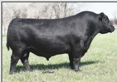
Ellingson Roughrider 4202's influence sells.