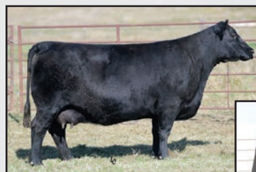
Miss Blackbird 5054, the dam of Lots 213-215.