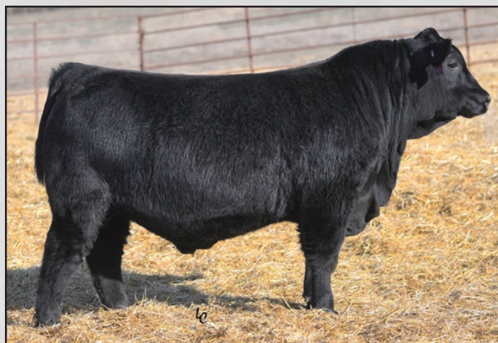
Ellingson Profound 1242, a full brother to Lots 226-231.

Every Profound son selling in this year's sale is produced via embryo transfer, which provides an unprecedented opportunity to capture the power-boosting ability of Profound paired with one of the very best cows on the ranch in every single lot selling. The Profound x Juneau and Advance combination has yielded numerous front-end herdsires, including Prolific, Bold, Preeminent and Statement, all bulls being utilized back in our breeding program. These bulls' Pathfinder donor dam by Koupal Juneau 797 has recorded a production birth ratio of 5/96, a nursing ratio of 5/107, a yearling ratio of 3/103 and a ribeye ratio of 1/111 and settled to first-service A.I. every year of her production career thus far. She has impeccable foot design and soundness paired with elegant femininity and maternal softness. She earned her spot on the donor roster the old-fashioned way – through superior production and fertility. Their full brother was Lot 2 and the $22,000 feature of our 2022 production sale. Sixteen full and maternal sisters have been retained in our cowherd. Lots 226-231 are flush brothers.