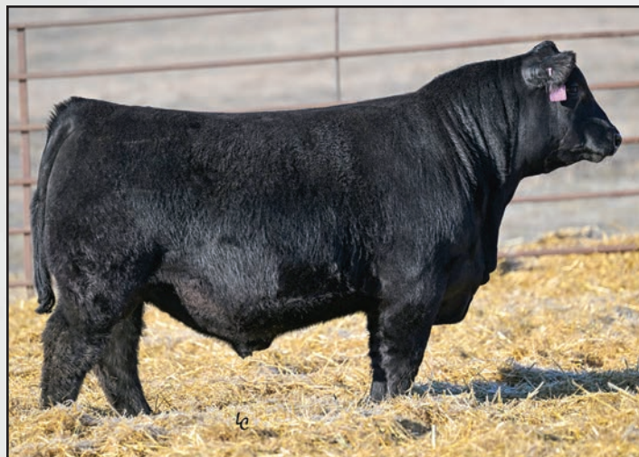
Lot 26, Ellingson Badlands 3060.

There is no stronger way to start off the largest sire group of the offering than with an elite herdsire candidate that traces twice to the cornerstone EA Bells Girl 2181 donor right at the front of his pedigree. His genetic package covers the bases of profitable and problem-free beef production as thoroughly as any in the offering. Phenotypically, he is as complete as you will find, with superb structural correctness, length, smooth profiling and an abundance of dimension throughout. His dam has recorded a production nursing ratio of 5/103, a yearling ratio of 3/105, a ribeye ratio of 3/104 and a 362-day calving interval, having settled to first-service A.I. every year of her production career thus far. She is a maternal sister to the well-known Bells Girl flush of sisters that include the Pathfinder donor EA Bells Girl 7617, best known as the dam of Badlands, Brickhouse, Preminent and Progressive. Maternal brothers have been selected in past sales by Shawn and Jayne Hinsz and Ham Ranch, while a full brother was the $17,000 selection of Jeff and Leann Schafer in last year's production sale.