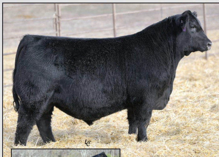
Above: Ellingson Rider Pride 0343, a full brother to Lot 272.