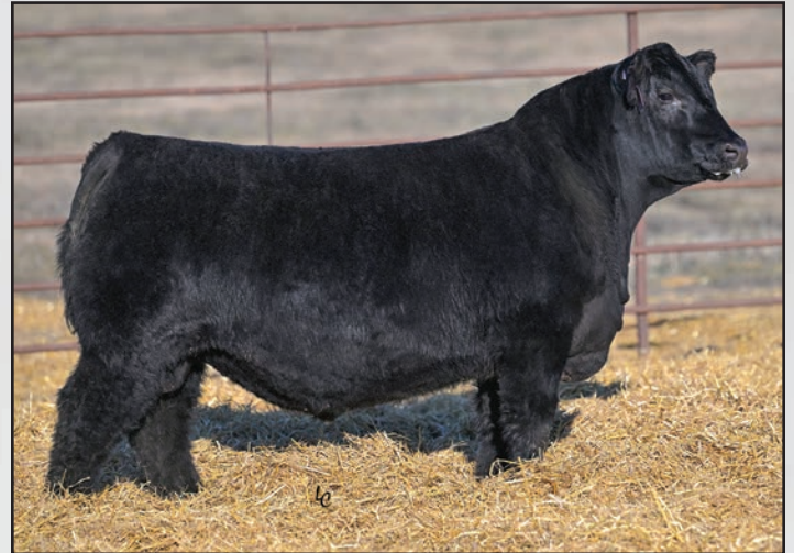
Lot 28, Ellingson Badlands 3008.