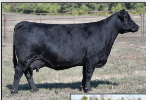
Left: EA Bells Girl 7617, a full sister to the dam of Lot 111.