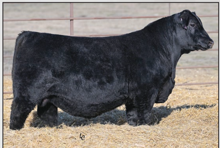
Lot 213, Ellingson Proficient 3181.