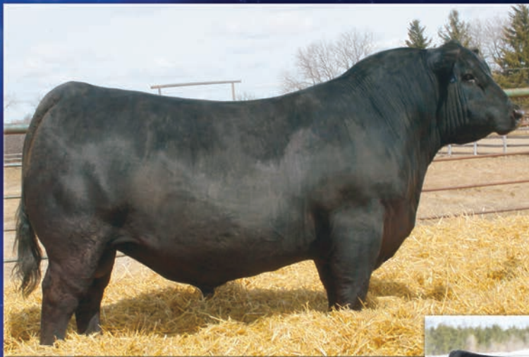
Ellingson Profound 8155