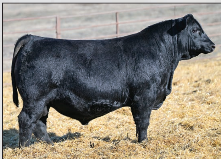
Lot 143, Ellingson Turn Key 2984.

Ellingson Turn Key 3978 is not one many should miss on sale day. He stacks together some of the most productive dams on our ranch and pairs that with an explosive early growth curve. His Pathfinder donor granddam has posted a stellar production record, with a production birth ratio of 6/100, a nursing ratio of 6/109, a yearling ratio of 2/114, a ribeye ratio of 2/103 and a 367-day calving interval, all while being flushed. She is the mother of the $90,000 Ellingson Navigator, as well as Lots 1 and 2 in this offering. A maternal brother was selected by Shawn and Jayne Hinsz in last year's sale.