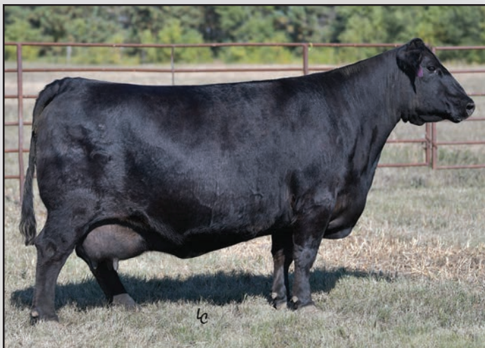
EA Emblynette 2015, the dam of Lots 203-207 and granddam of Lot 208.