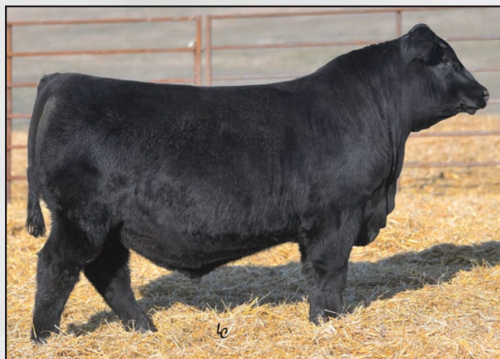
Ellingson Blockade, the sire of Lots 132-134.